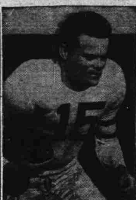
STEVE VAN BUREN, Philadelphia Eagles back and last year's national leading ground gainer (847 yards) and second best scorer in intercollegiate ranks while playing for Louisiana State, is being boomed as the "Professional Rookie of the Year." A 201-pounder who made the All-Pro team, Van Buren has averaged over 5-yards per carry this season.

The eight o'clock game pits Talbot's Midget opposite Chemawa's All-Stars, both quints losers in last week's league debut. At nine the loop lead sharing Funland five clashes with General Finance. Most of the circuit members are said to be filling in weak spots for one of the tightest derbies in City history in recent years.