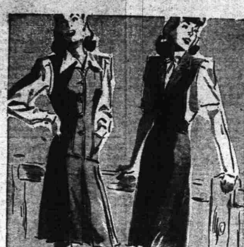
EVERY GIRL WANTS JUMPERS, JERKIN SETS

4.49, 4.98 A slipon and a cardigan matched in color and in the same quality pure wool! She'll treasure them! Wards have the slipons at 4.98... the cardigans at 5.98. 34-40.