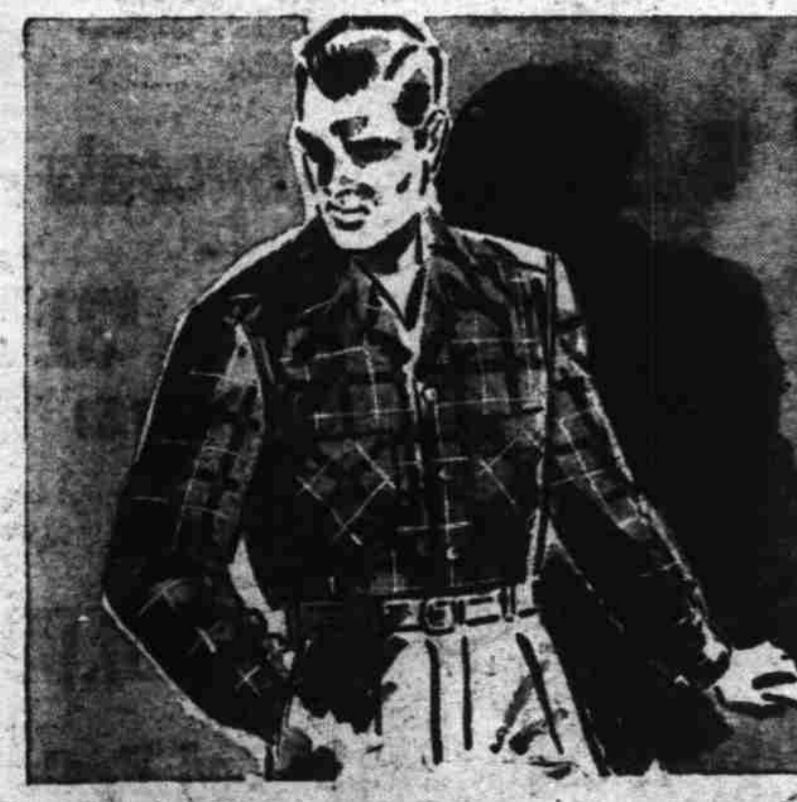
GIVE HIM A SPORT SHIRT FOR CHRISTMAS 3.98

Santa, be sensible and include at least one practical gift this year. Make it a becoming cotton dress that she'll keep on enjoying long after Christmas is over! Wards have so many really good looking ones in her favorite button front and shirtwaist styles. Lots of tubbable cottons in smart checks and stripes, and sizes for everyone... 12 to 20, 38 to 44, 9 to 15.