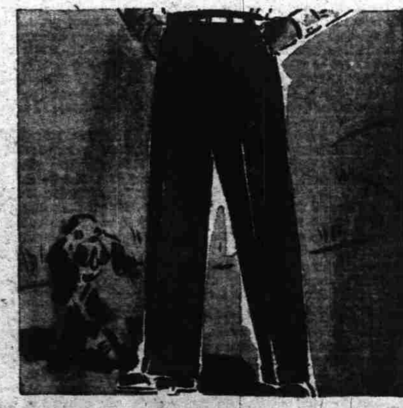
TROUSERS ARE PERFECT CHRISTMAS GIFTS! 6.98

3 pr. 1.10 39c Gifts that can't miss! Handsome rayons and cottons noted for quality, wear in the styles men like best!