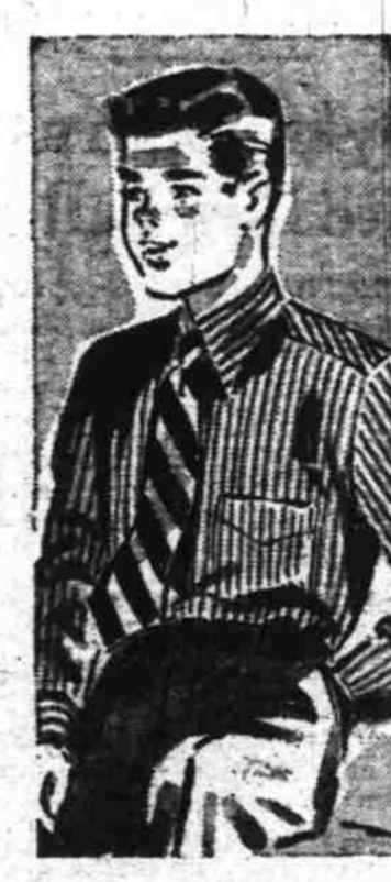
BOYS' DRESS SHIRTS ARE IDEAL GIFTS

4.98, 7.98 Beautifully printed and beautifully made! Together they're an ensemble that's a really lavish gift. In delicate shades of tearose or blue. Sizes 34 to 40.