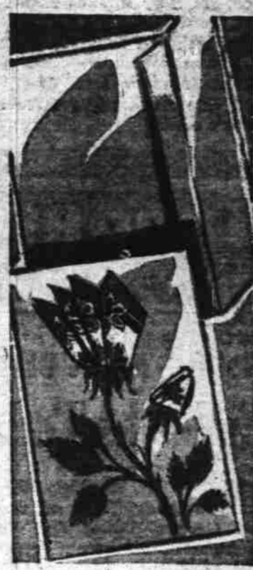
A CHRISTMAS HANKIE ALL READY TO MAIL

Here are some beautiful, full fashioned stockings in fine quality semi-sheer rayon! You'll like their smooth, rich look, their dull finish their excellent fit! And you'll like their long wear too! Get them in new flattering shades that go so well with everything. Sizes 8 1/2 to 10 1/2. Special note: For better service get three pairs: one to wear, one to wash, one to dry!