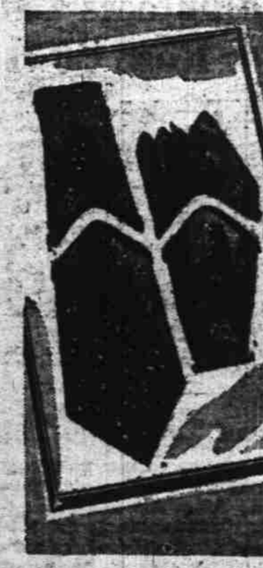
TIE AND HANDKERCHIEF SETS MAKE SMART GIFTS

3.98 Give him a pair of these handsome, rugged gabardines! They're masterfully designed and tailored. In all the rich colors boys like!