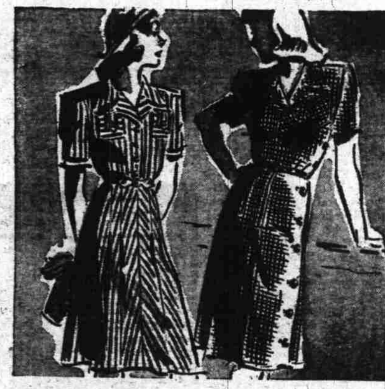
A PRETTY COTTON DRESS IS FIRST ON HER LIST 3.98

3.98 Give her Wards pleated-front slacks. They fit so smartly! Rayon gabardine in navy, brown, green, red, powder blue or luggage. 24-30.