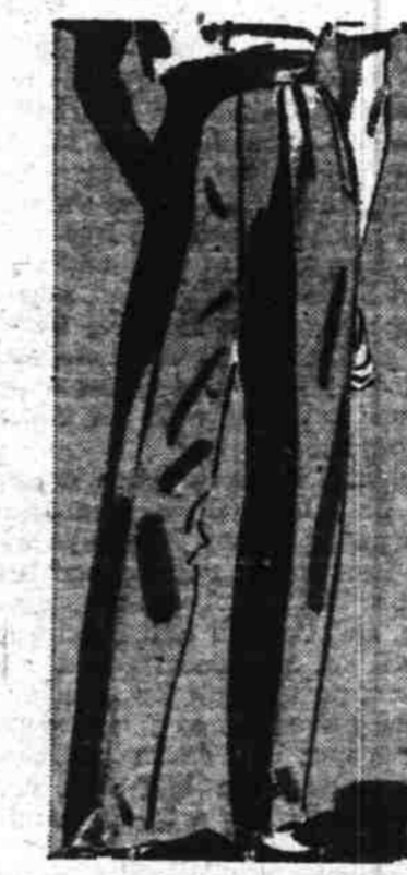
DOES SHE LIKE SPORT CLOTHES? GIVE SLACKS

2.98 Gifts boys can wear are more than welcome! Expertly tailored shirts, cut full for action! In smart woven stripes, solid tones. Tubfast!