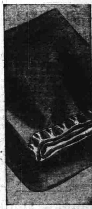
WARDS FAMOUS BLENDED BLANKET

She'll like the smooth, rich feel of their rayon crepe. She'll appreciate the sleek way they fit, and she'll notice how nicely they're finished! Best of all, she'll like their handsome flower pattern—so smart and so new-looking! Come in! Look them over thoroughly before you buy! You'll agree with us that they'll make marvelously welcome gifts! Sizes 34 to 40.