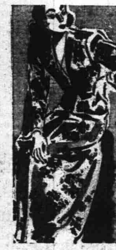
RAYON SATIN GOWN, MATCHING COAT

7.98 Scientific blends of new wool for warmth, for beauty, for strength! 3 pound, 72 x 84 inches. Smart pastels, bound with rayon satin.