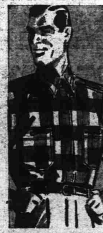
100% VIRGIN WOOL PLAID SHIRTS

1.98 Compliment the men on your Christmas list with handsome matched kerchiefs and ties! Splendidly designed and tailored of rich fabrics. Boxed.