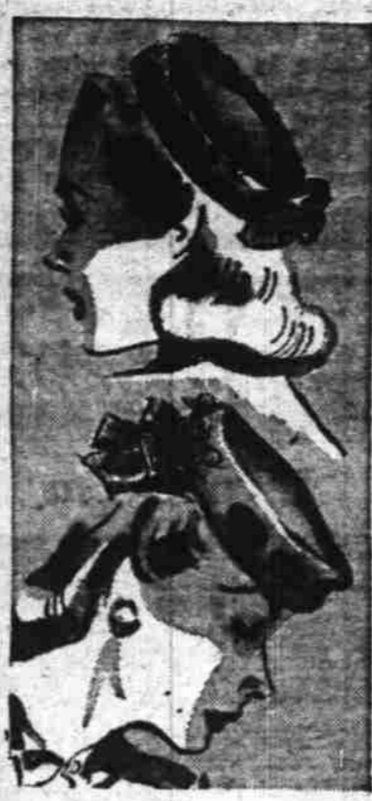
WARDS FELT BUMPERS ARE FALL FAVORITES

49c Made of fine cotton and hand screen printed in beautiful pattern! Packed in a colorful gift envelope! Address, stamp and mail it—that's all!