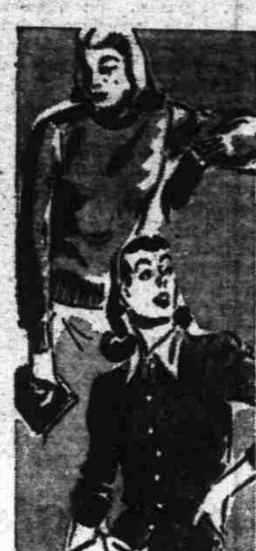
GIVE HER A FINE CAROL BRET SWEATER SET!

1.98 Just wait 'til Mother sees these! They're just as pretty as they're practical. Dainty pinafore and bib styles—and lots of exciting colors!