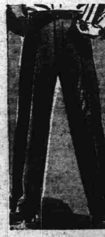
BOYS' TROUSERS ARE EXCELLENT GIFTS

Make him proud of his gift on Christmas Day... proud of the quality fabric... the superb tailoring... the dependability that's built-in. These handsome sport shirts are made of rugged Teca-and-spun rayon—a fabric remarkable for its durability... for the richness of its texture. Wards have a splendid assortment of good-looking plaids, rich solid tones.