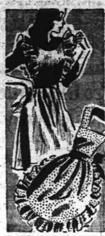
ADD A PRETTY APRON TO MOTHER'S GIFT!

1.98, 2.49 Perky bumpers for your casual fall outfits! A saucy dimpled brim and a neat stitched one with tidy ribbon trim in back. In all the newest fall colors.