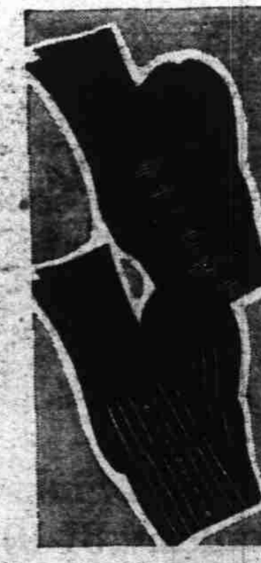
GIVE HIM NATIONALLY FAMOUS ESQUIRE HOSE

7.98 Lovely shades in attractive he-man plaids for that favorite man. Sizes small, medium and large.