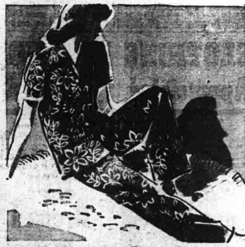
GIVE HER GAY PAJAMAS IN FLOWER PRINTS 3.98

4.98 Which one shall it be? Just ask Wards! We know just what the soda crowd likes, and look what a selection we have! Three smart styles in jumpers for sizes 12 to 20... two in jerkin sets for 12's to 18's. There's rayon gabardine, cavalry twill, rayon strutter cloth! And what's more all these heavenly colors... powder blue, lime, melon, green, gold, fuchsia, or aqua.