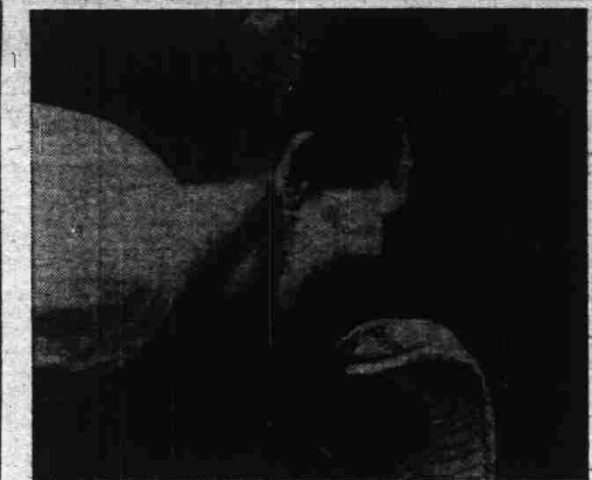
The "Snake Kiss"! The shocking, breath-taking climax to a thousand thrills filmed by the Denis-Roosevelt Asiatic expedition in "Dangerous Journey," the sensational 20th Century-Fox release now playing at the Grand theatre. Here you see a Burmese priestess kissing the deadly King Cobra, knowing one false move means horrible death.

KOAC—FRIDAY—550 kc. — 10:00 News; 10:15 Homemakers; 11:00 School of Art; 11:30 Concert Hall; Noon News; 12:15 Farm Hour; 1:00 Bid'n' the Range; 1:15 Soldiers of Peace; 1:30 Variety Time; 2:00 Club Women; 2:30 Memory Music; 3:00 News; 3:15 Music of Masters; 4:00 America's Music; 4:15 Memorable Music; 4:30 Treasury Salute; 4:45 Novelties; 5:00 Upbeat; 5:25 Navy Recruiting; 6:00 News; 6:15 Farm Hour; 7:00 Music Czechoslovakia; 7:30 Symphony of Melody; 8:30 Music; 9:30 News; 9:45 Meditations.