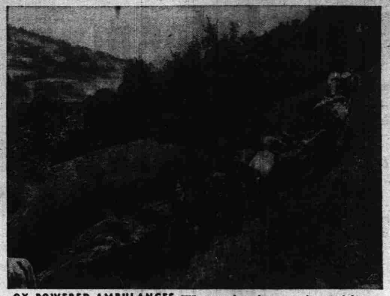
OX-POWERED AMBULANCES —With wagons drawn by oxen serving as ambulances, wounded Yugoslavian partisan fighters are moved from a field hospital to a hideout.

PORTLAND, Nov. 10—(AP)—Gov. Earl Snell has designated November 1 as "Thanksgiving Sunday," marking it for a day of thanksgiving for "the beauty of Oregon roadides and matchless scenery." The Oregon roadside defense council urges special Thanksgiving Sunday programs in the state's churches.