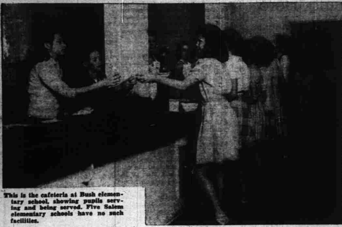
This is the cafeteria at Bush elementary school, showing pupils serving and being served. Five Salem elementary schools have no such facilities.