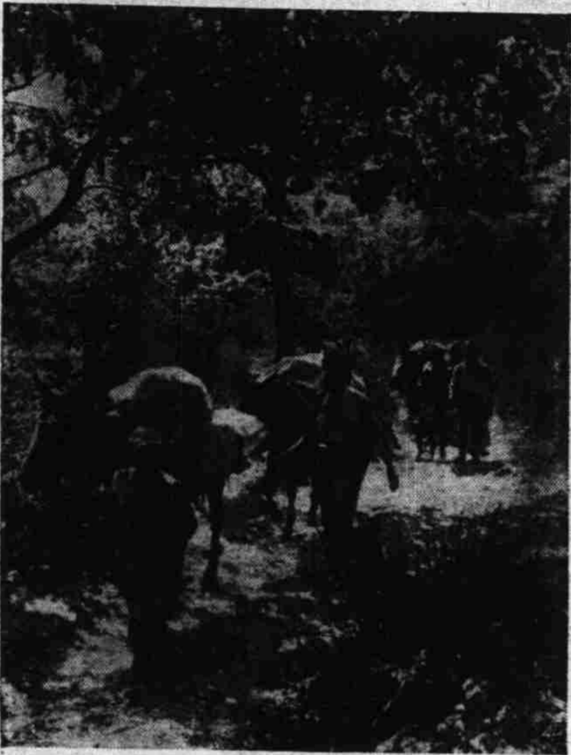
PACK MULE TRAIL —They may look like prospectors but actually they're members of an infantry unit of the Fifth Army in Italy, operating over mountain trails requiring pack mules for transportation of supplies.