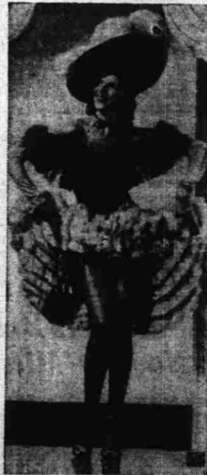
FETCHING —Movie Star Rita Hayworth, prominent contributor to service men's "pin-up" art, poses in a costume she wears for a new picture.