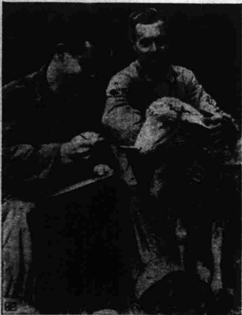
LAMB AT REST CAMP —Two soldiers of the U. S. Third Army feed a lamb which has wandered into a rest camp established for front line troops in France. Some of the men have been in combat for two months straight.