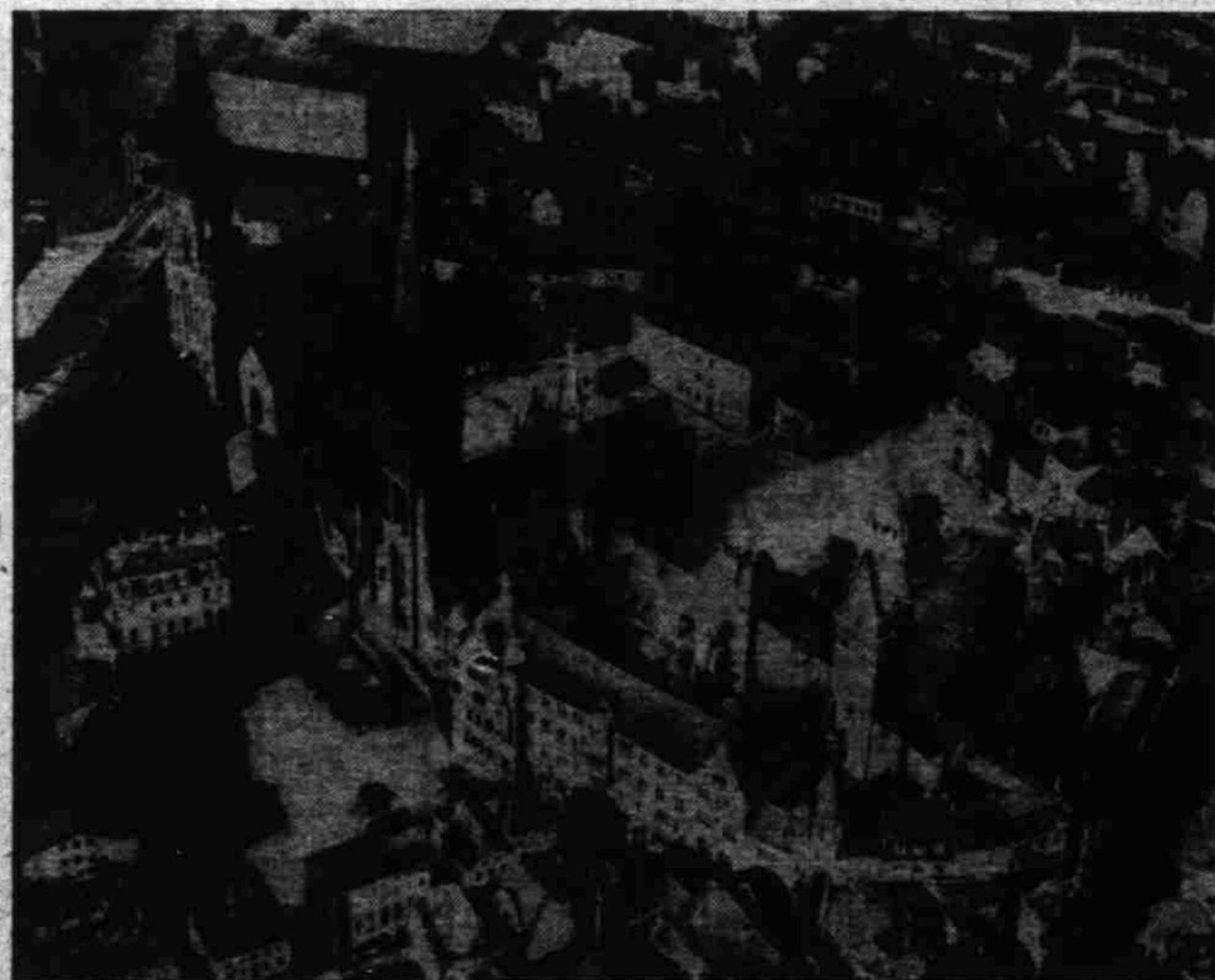
RHINELAND CITY —Aerial view of the center of Duisburg, Germany, on the right bank of the Rhine near its confluence with the Ruhr, which is an important industrial city.