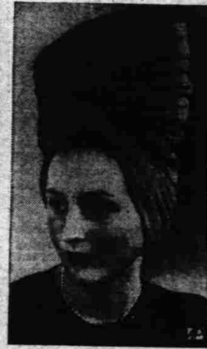
PARISIAN —So this is Paris! Yellow wool, topped by a crown of green felt, is used in this chapeau which made its appearance in a style show in the French capital.