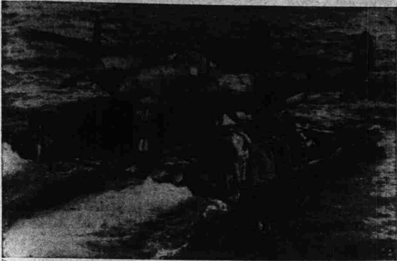
'DUCKS' HAUL P-38 ASHORE —Two "ducks," lashed together, transport a P-38 fighter from ship to shore, making it possible to send fully-assembled planes overseas.