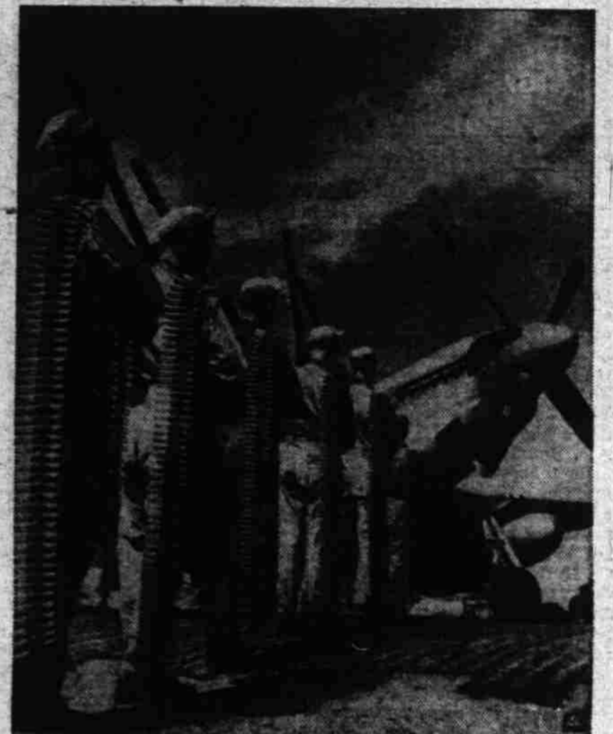
MUSTANG'S KICK —Armorer's carry belts representing ammunition for only one of the six .50 caliber machine guns with which the P-51 Mustang fighter, now flown by the U. S. Eighth Air Force, is armed.