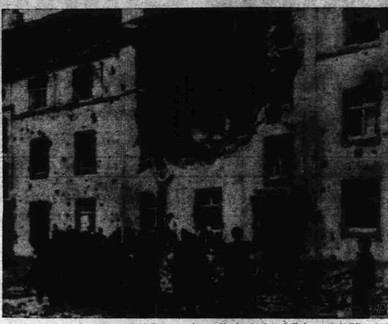
A Yank stands guard over a group of German pri the German city of Aachen during the battle for the German city, near the Belgian border.