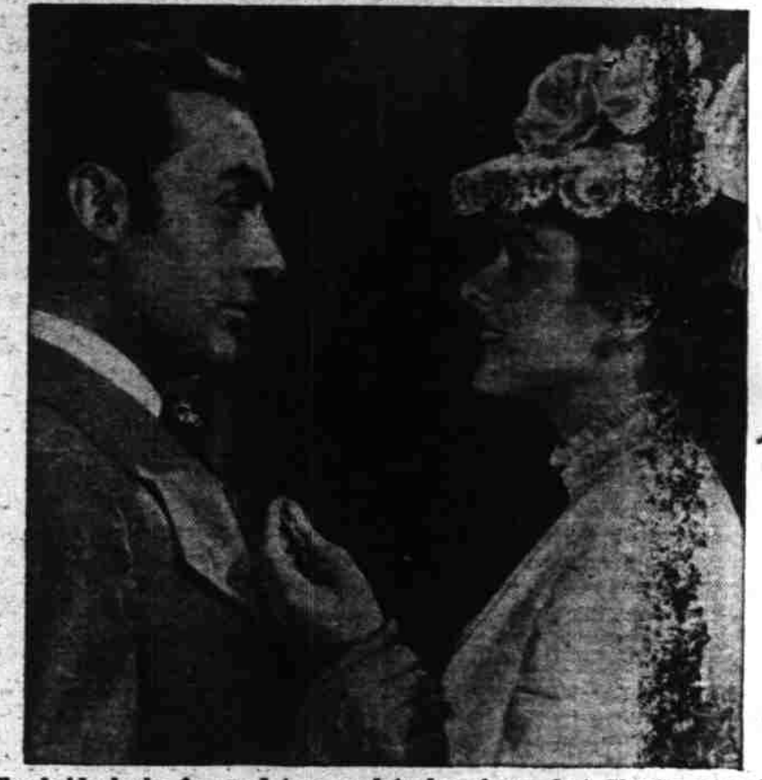
The bride looks forward to complete happiness, but Charles Boyer's plans bring far different results for Ingrid Bergman in Metro-Goldwyn-Mayer's dramatic story "Gaslight," which is now showing at the Capitol theatre.

The sessions will be open to all school administrators in Idaho.