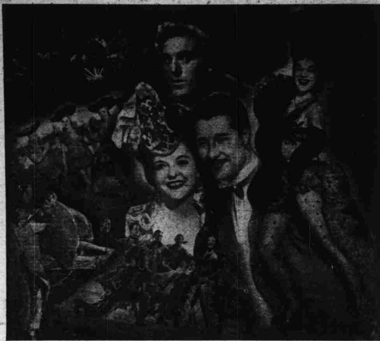
Just a rumba-sway from the gay White Way, there's dancing in the streets . . . loving in the park—a joy-mad Mardi-Gras from dawn 'til dark! You'll find it all in "Greenwich Village," the new 20th Century-Fox technicolor musical starring Carmen Miranda, Don Ameche, William Bendix and Vivian Blaine, "The Cherry Blonde," now showing at the Elsinore theatre. Jammed with glorious gals and high hilarity, the brilliant hit, directed by Walter Lang and produced by William Le Baron, has a score of scintillating new song hits by Leo Robin and Nacio Herb Brown.