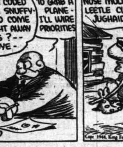
LITTLE ANNIE ROONEY