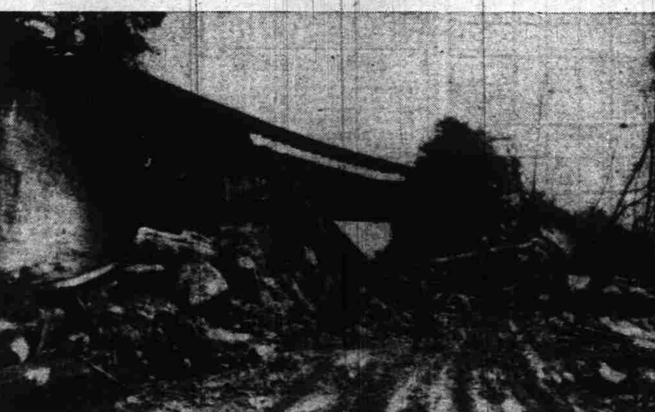
BRIDGE BLASTED IN RETREAT_U. S. doughboys look over wreckage of a railroad bridge near Aachen, Germany, blown up by retreating Nazis to slow the Allied drive.