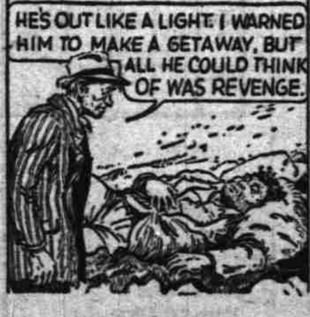
LITTLE ANNIE ROONEY