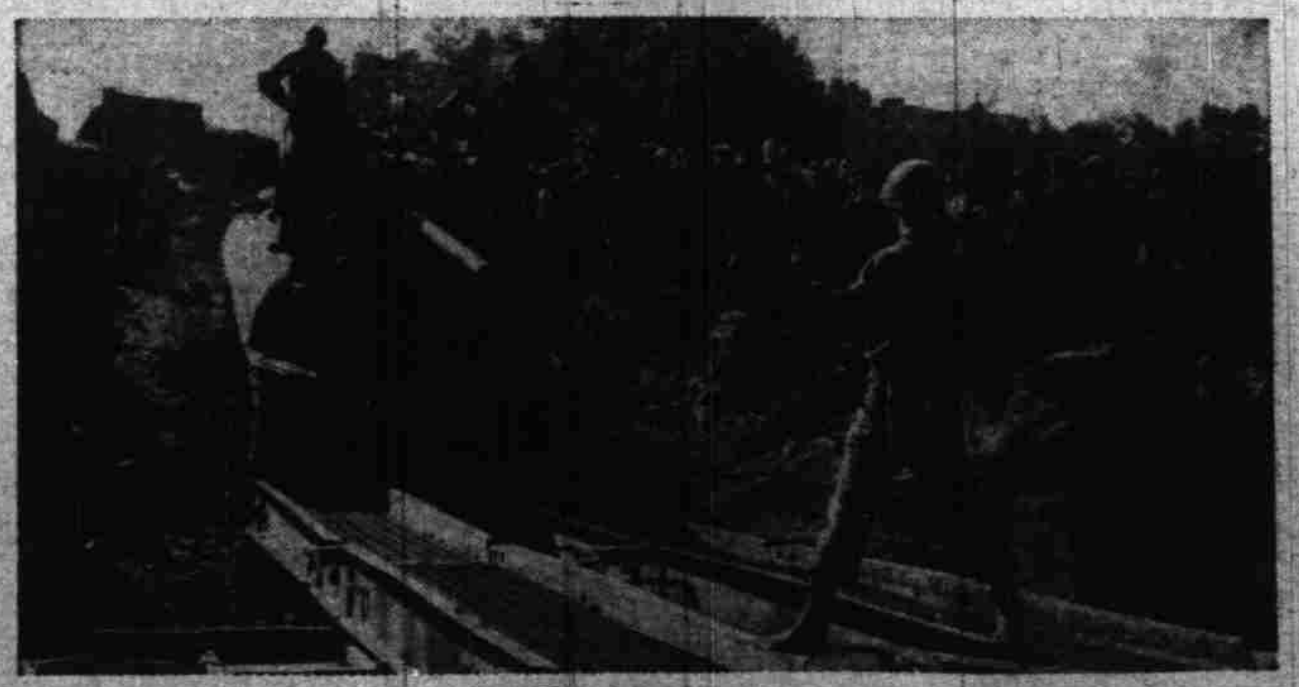
U. S. TANK CROSSES MEUSE...A U. S. engineer guides a tank driver onto the trend-ways of a bridge built across the Meuse River in Belgium, to aid the Yank advance.