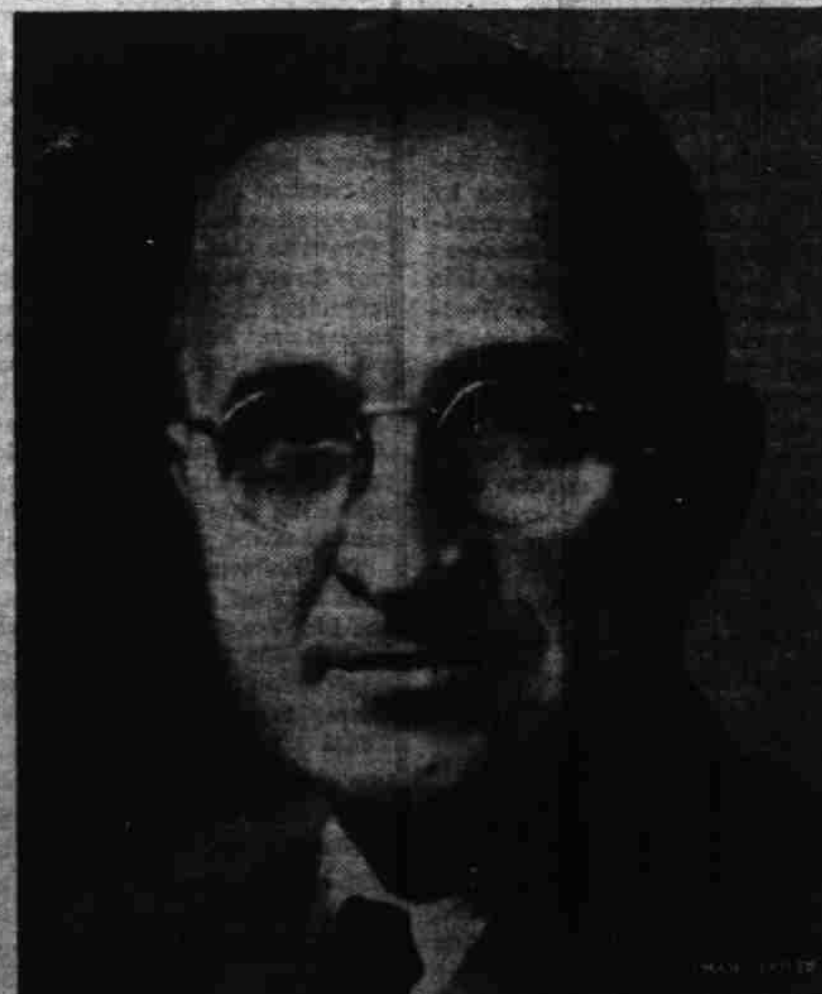
NOMINEE —Official campaign picture of Senator Harry S. Truman, Democratic vice presidential nominee.