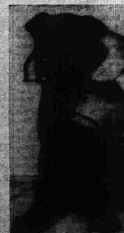
BLACKOUT —Here is "Blackout," Coast Guard mascot on an LCI, who went ashore in Sicily, Italy and Normandy. He wears a life jacket made by his pals—just in case.