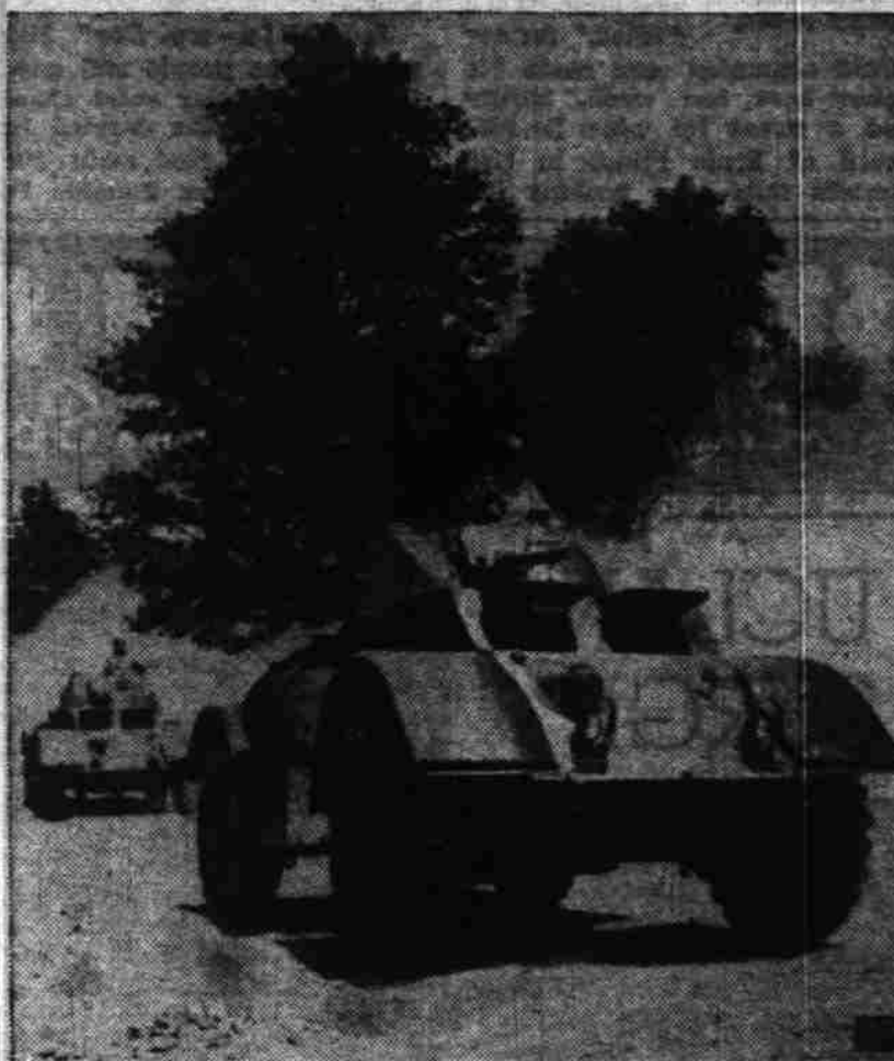
ALLIES' NEW 'STAGHOUND' —Made during tests on a factory proving ground, this picture shows the new 14-ton armored car, called the "staghound," which is spearheading Allied advances in the European theater.