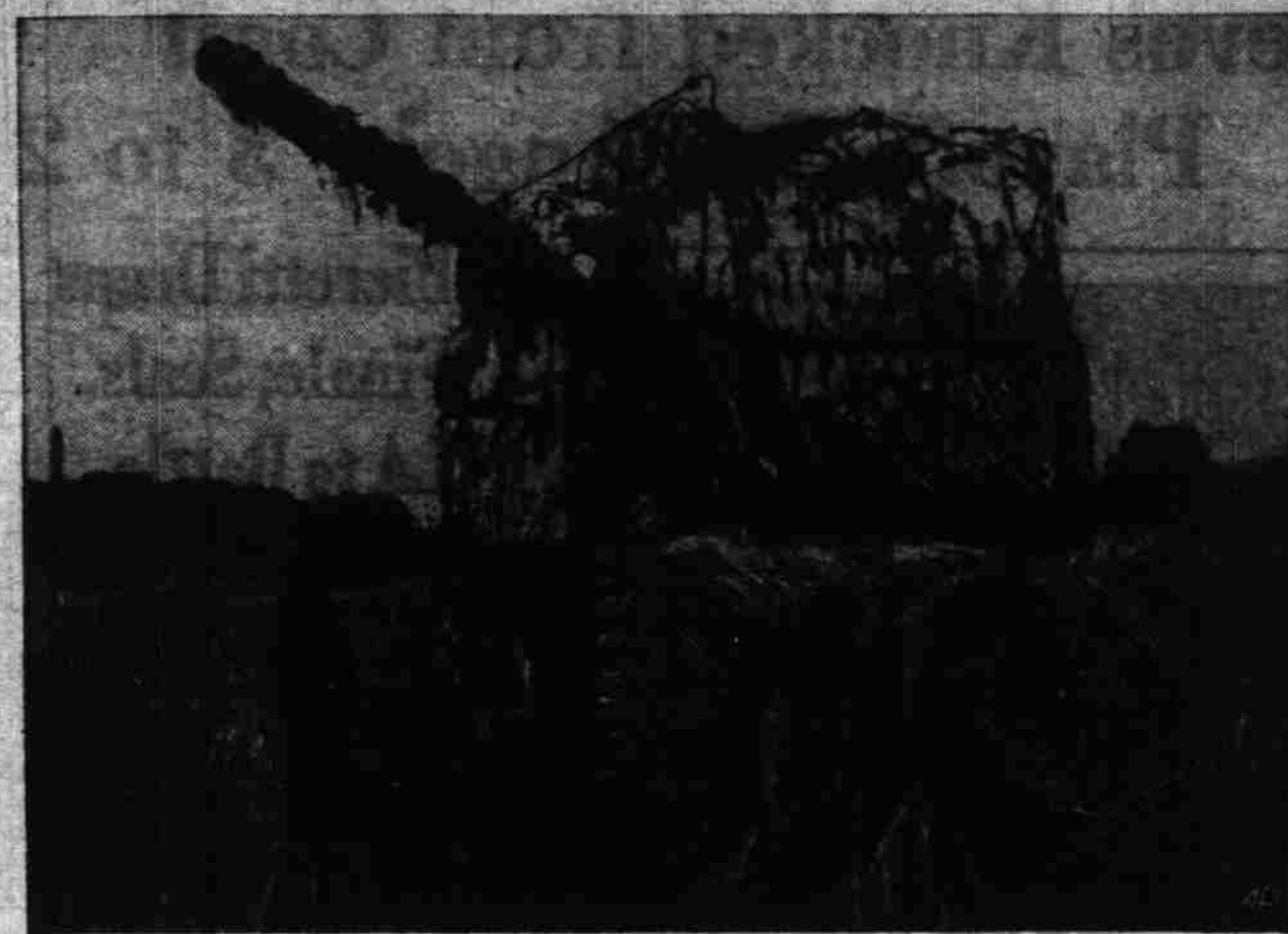
DUMMY GUN CAMOUFLAGED —Canadian troops entering Montreal during their drive to Houtegne found this dummy 150-mm. gun camouflaged in a French grain field.