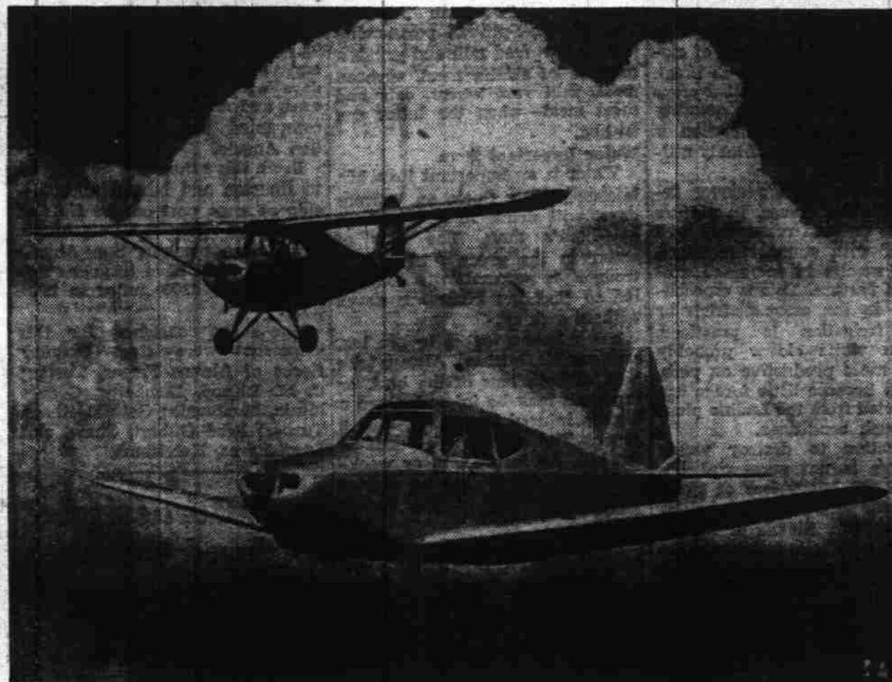
FOR POST-WAR FLYING —An experimental "coupe" (foreground) and a "roadster," in flight at the Aerocraft factory, Middletown, O., show what peacetime skies may hold.