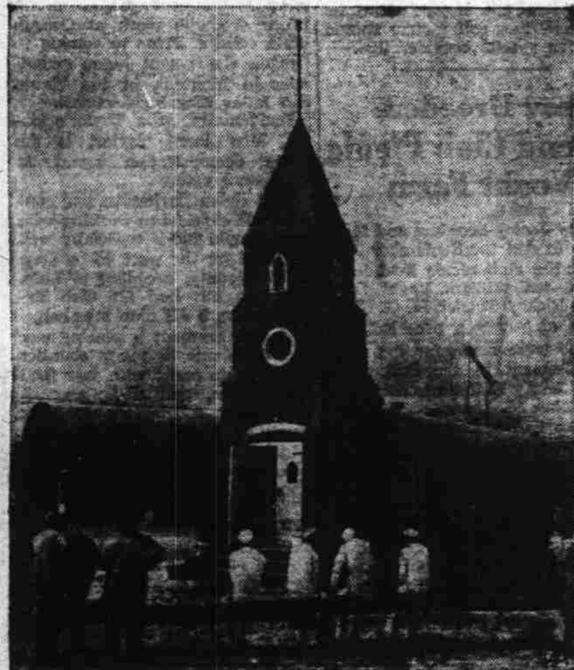
ENIWETOK 'CATHEDRAL' —Navy officers and enlisted men wait for services to start in this church on Eniwetok in the Marshall Islands group, made from a Quonset hut by adding a formal entrance and a conventional steeple.