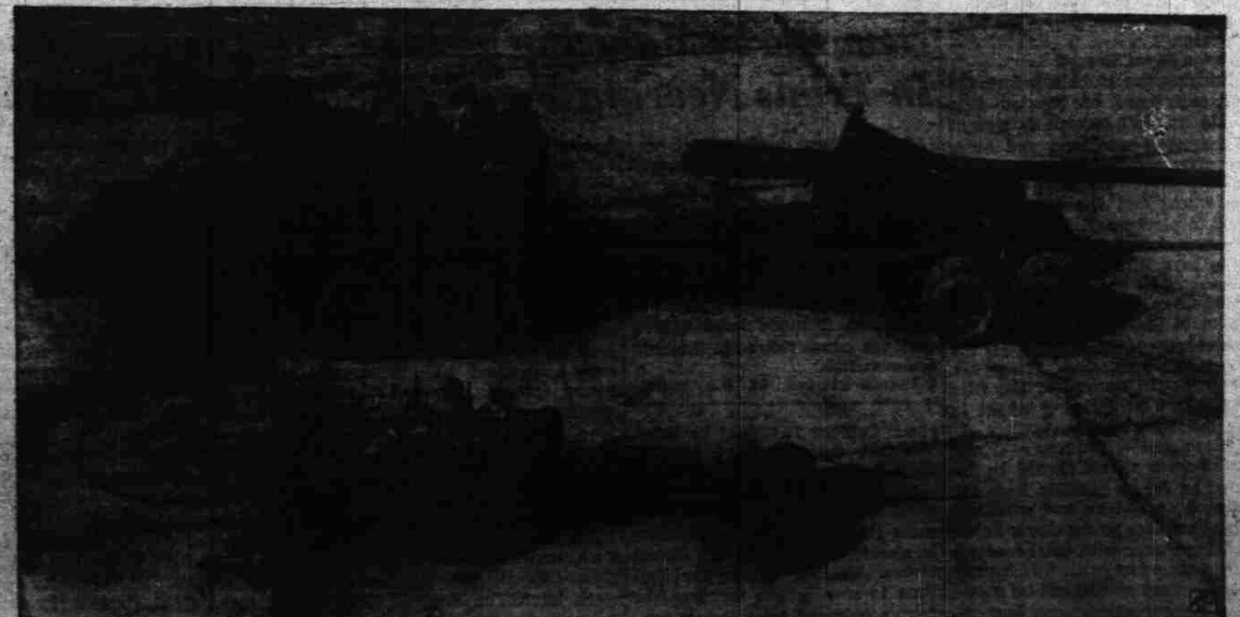
ARMY'S BIG AND LITTLE TRUCKS —At Aberdeen Proving Ground, Md., a 7 1/2-ton Mack, the Army's...