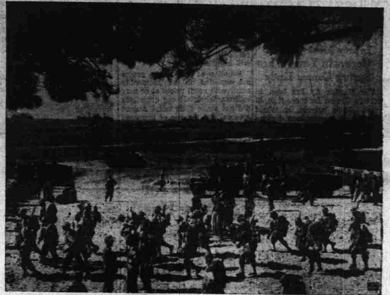
SUPPLIES FOR SOUTHERN FRANCE —Standing off the shore of southern France, Coast Guard-manned invasion transports unload reinforcements for the new drive.