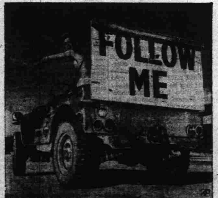
GUIDE FOR BOMBERS —Giant U. S. bombers landing on Eniwetok atoll in the Pacific follow the lead of this jeep when maneuvering to a parking space.