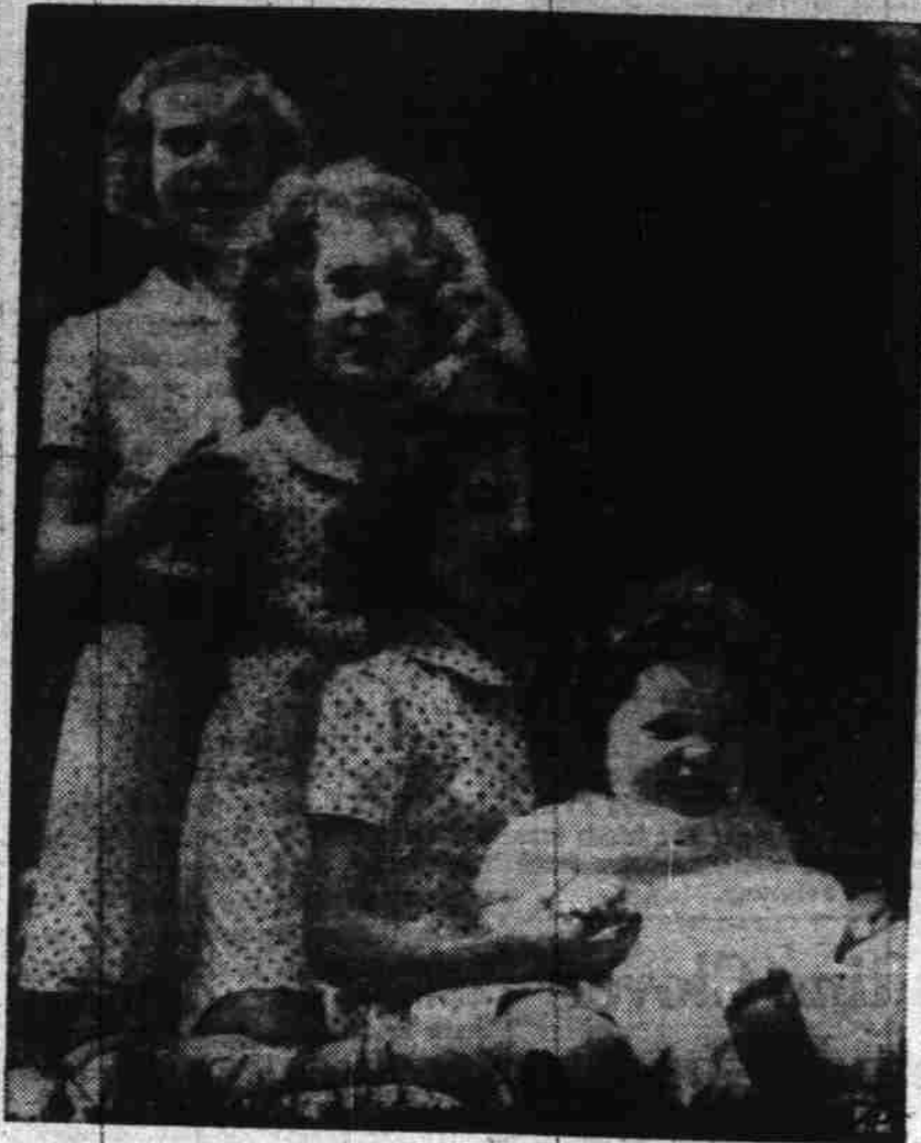
SWEDISH PRINCESSES —The four daughters of Prince Gustaf Adolf and Princess Sibylla of Sweden enjoy themselves at their home in Haga, near Stockholm. Top to bottom are Princesses Margaretha, Birgitta, Deafore and Christina.