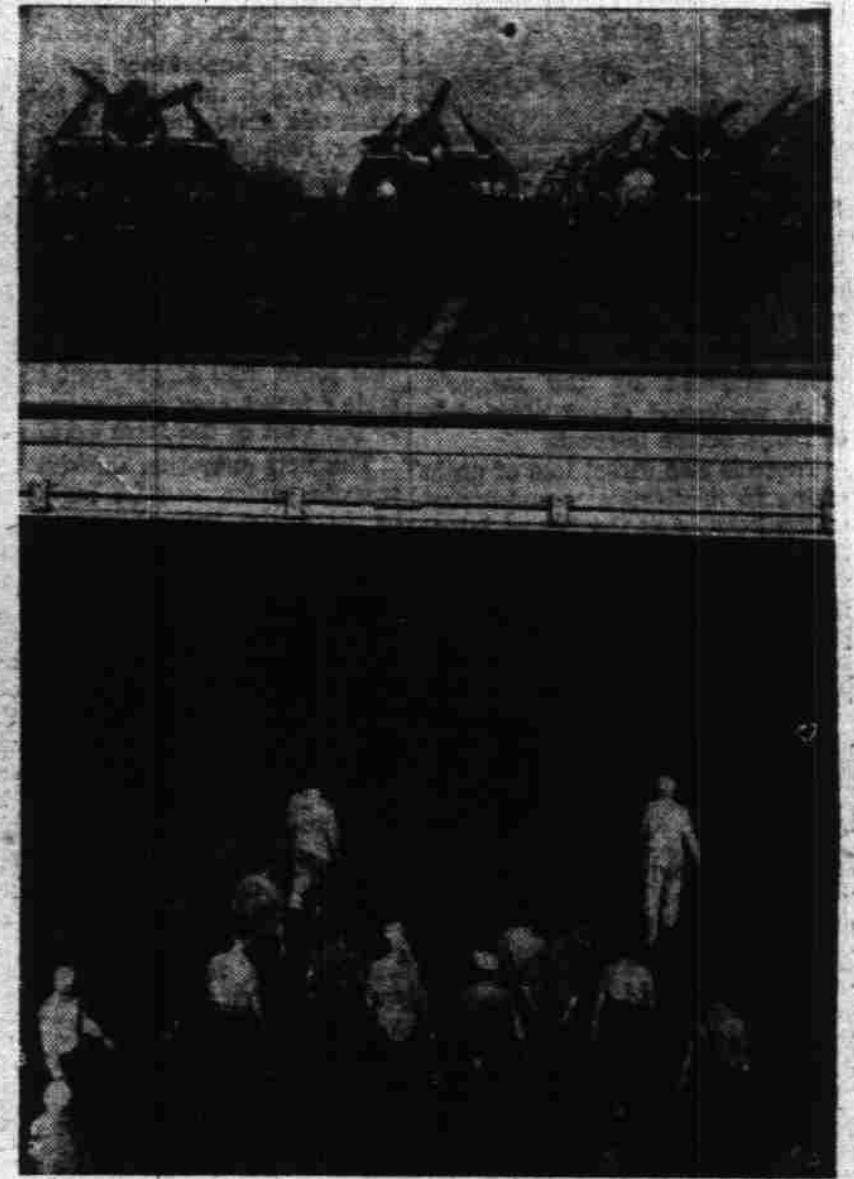
ACTION ON TWO LEVELS —While crewmen on the flight deck of a Navy carrier work on planes spotted there, other personnel prepares to leave an elevator descending to the hangar deck where additional ships are stored.