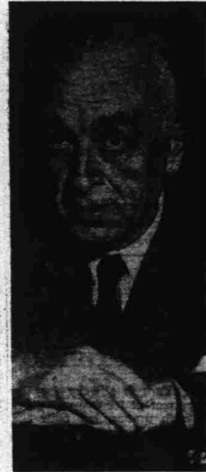
NEWSMAN —Leon Rollin (above), director of the French News Agency, urged in Paris a completely free world press as advocated by leaders of journalism in the United States.