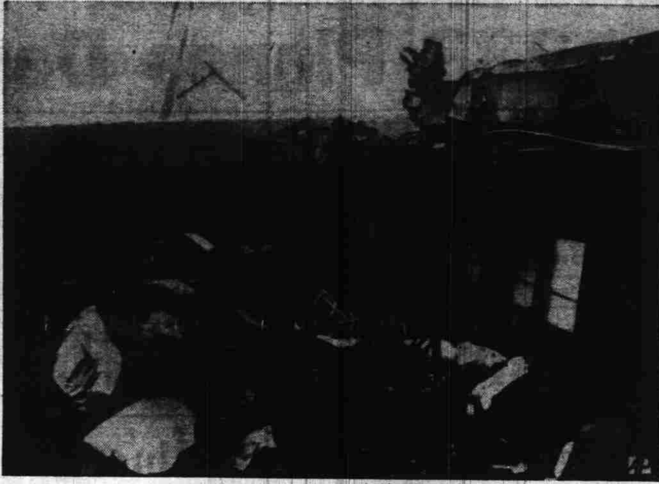
This is the interior of a Pullman car in which soldiers were sleeping when two fast Chicago and Eastern Illinois passenger trains collided head on in a heavy fog three miles north of Terre Haute, Ind., killing at least 26 persons and injuring an estimated 65 others, many of whom were overseas air force veterans wearing purple heart decorations.