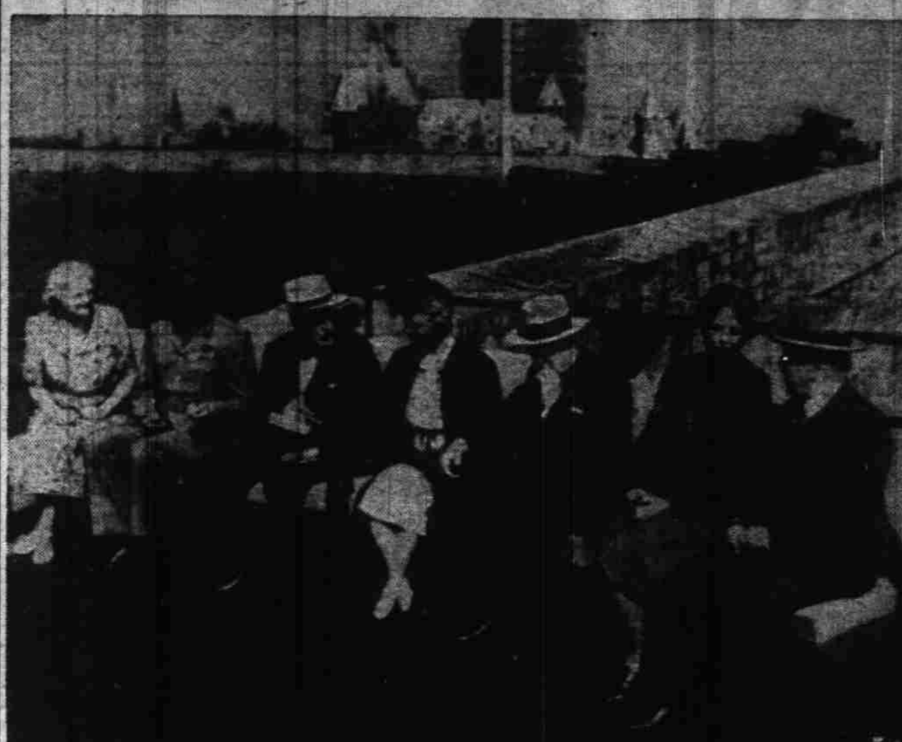
Leaders of the Quebec conference and their wives have their pictures taken atop the citadel where the Roosevelt-Churchill talks are taking place. They are, left to right, Mrs. Churchill, the Earl of Athlone, President Roosevelt, Princess Alice, Prime Minister Churchill, Mrs. Roosevelt and MacKenzie King, Canadian prime minister.