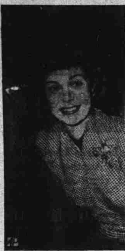
NATTY — Jane Wyman, film star, wore this chic outfit when she arrived in New York City for a recent visit.