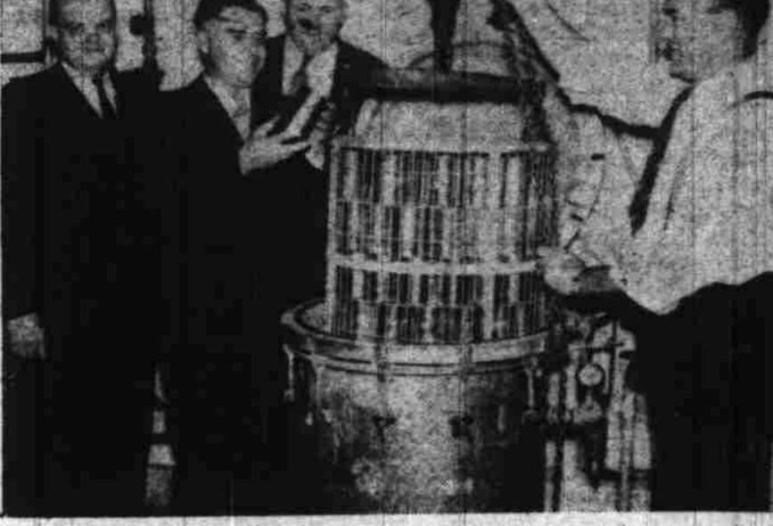
On a recent tour of five school community canneries with the state food production war training committee, this group observed the completed cook of 170 cans of beans in one of the four large pressure cookers in the Salem Community cannery located in the Bonesteel building, 3950 Portland road, Salem.