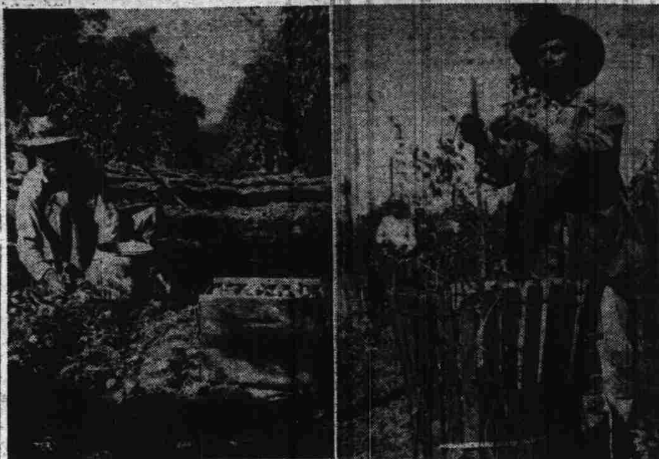
Mexican nationals picking Willamette valley prunes and hops this year will serve a dual purpose of assisting in the harvest of these crops and relieving the farm labor pressure so that there will be an adequate number of bean pickers. The peak number of Mexican farm workers in Oregon will be only about 10 per cent of the 50,000 seasonal farm workers needed from about August 20 to September 20.