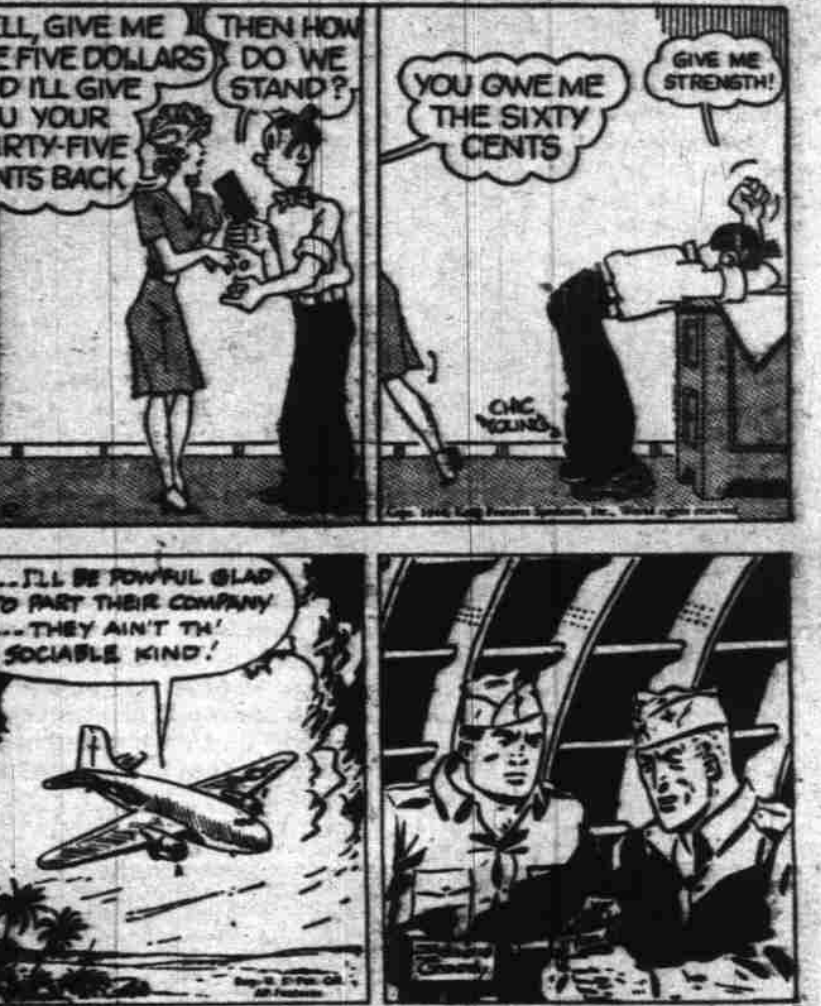
LETLE JUGHAD !!