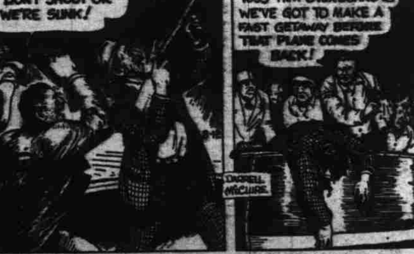
OKAY, SIR— I AM UPPING