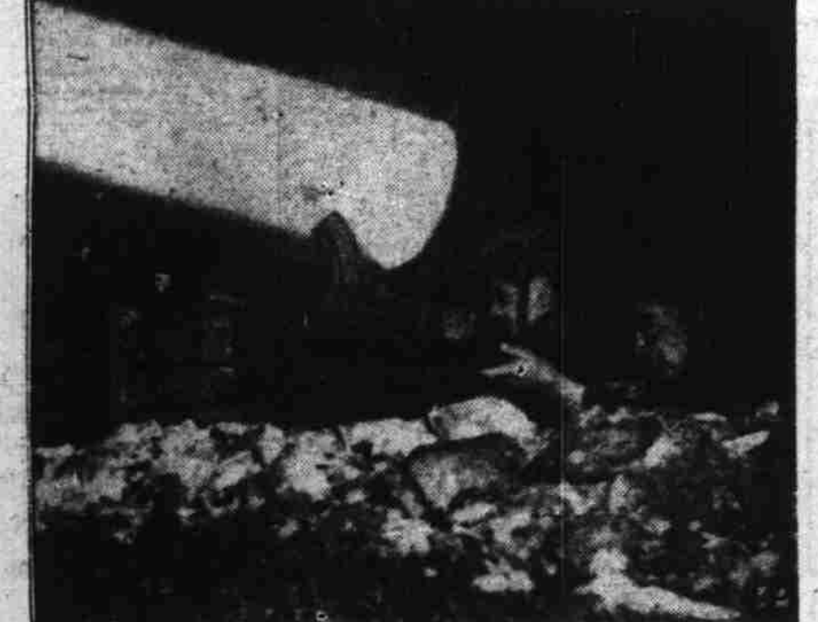
ON NORMANDY FRONT—An Allied machine gunner and a rifleman with bayonet fixed use a powerful searchlight to help them spot the enemy during a night advance by British and Canadian fighting units on Normandy front, south of Caen, France.

MATCHED PINTO mares, 4 yr. broke 6 yr. gelding. Men only. WANTED: Saddles, bridles, pony saddles. Shetland D. 2, 3, 4, 5, 6, 7, 8, 9, 10, 11, 12, 13, 14, 15, 16, 17, 18, 19, 20, 21, 22, 23, 24, 25, 26, 27, 28, 29, 30, 31, 32, 33, 34, 35, 36, 37, 38, 39, 40, 41, 42, 43, 44, 45, 46, 47, 48, 49, 50, 51, 52, 53, 54, 55, 56, 57, 58, 59, 60, 61, 62, 63, 64, 65, 66, 67, 68, 69, 70, 71, 72, 73, 74, 75, 76, 77, 78, 79, 80, 81, 82, 83, 84, 85, 86, 87, 88, 89, 90, 91, 92, 93, 94, 95, 96, 97, 98, 99, 100.