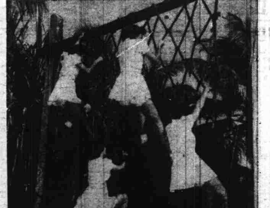
WAVES 'ABANDON SHIP'—Although they aren't likely to "abandon ship" by climbing down the cargo net, these WAVES at Miami, Fla., find the exercise helps develop endurance.