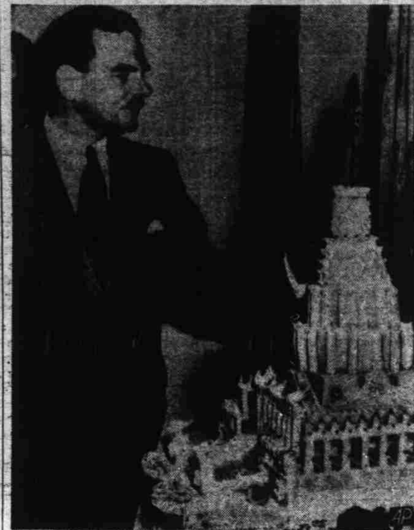
Gov. Thomas E. Dewey of New York, republican presidential nominee, looks at a cake made to resemble the White House at his hotel headquarters. It was presented to him by the hotel management.