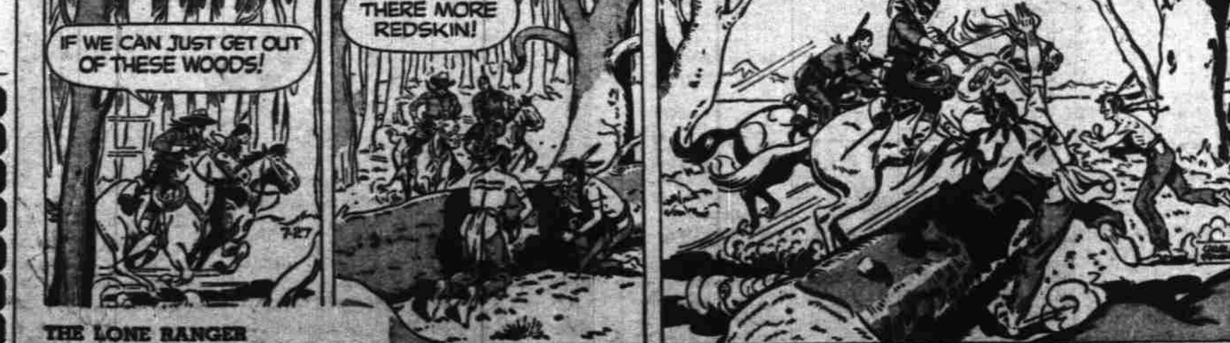
THE LONE RANGER