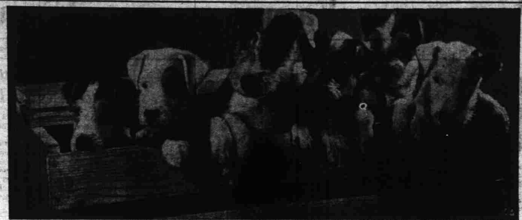
LOOKING THINGS OVER—Half a dozen cute puppies pose obligingly in a crate at the Chicago laboratory where they are being raised on a scientific diet to obtain data on dog food.

EARLY NEWS BY LOWELL THOMAS 7:15 P. M. DON LEE-MUTUAL Standard of California