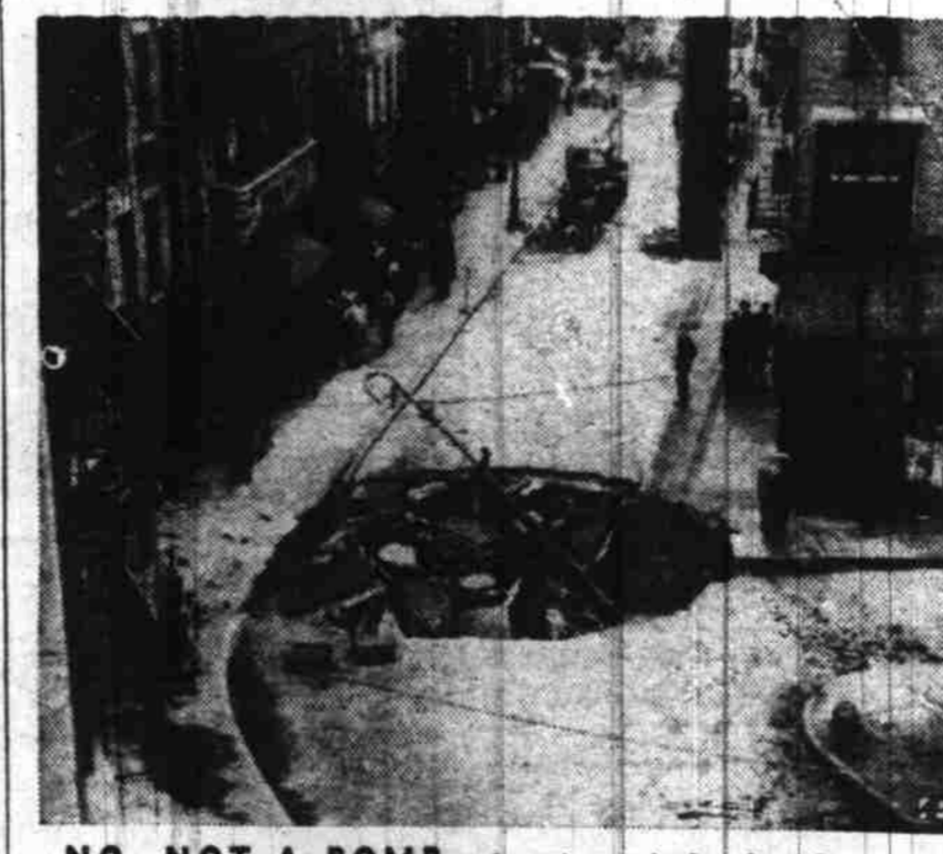
NO, NOT A BOMB—A water main break and gas explosion, not enemy action, made this hole in the paving at Mott and Pell streets, in the heart of New York's Chinatown.

7-26 HORIZONTAL 1. gone 6. Scandinavian territorial division 8. masculine name 12. above 13. shelter 14. tiresome person 15. zenith 17. Persian poet 18. forestall 19. Roman magistrate 20. female sheep 21. herring-sauce 22. emboldens 25. suffer 26. wrath 27. camera part 30. annex 31. oil: comb. form 32. lower limb 33. pastry 34. chafes 35. town in Iowa 37. Robtan gazel 38. bar of gold VERTICAL 1. display 2. avow 3. withered 4. three-legged stands 48. remnants 50. reverential fear 51. bristle 9. home 10. Russian inland sea 11. simple 16. morning moistures 18. fondle 19. hose 21. help 22. entire amount 23. insect 24. involving 25. citrus drink 27. steep, as fax 28. goddess of the dawn 30. three-toed sloths 31. public speakers 32. fondle 34. froth 36. breakwaters 37. rasp 38. brain passage 39. Ibsen heroine 40. farm machine 41. woody plant 42. penitential season 43. Icelandic literature 45. Oriental tea Answer to yesterday's puzzle. COS ABASE AFT ALE LITER MOO SLEEPS REPORT TALL EPI ARMS ACCENTS ALA ATA STAPE MORRIS TASSLE TOTER AWT STY CONSIST PERU EAR AIDE AVERSE LETTER DES ODDER EES ANT USERS REN 7-26 Average time of solution: 31 minutes. Dist. by King Features Syndicate, Inc.