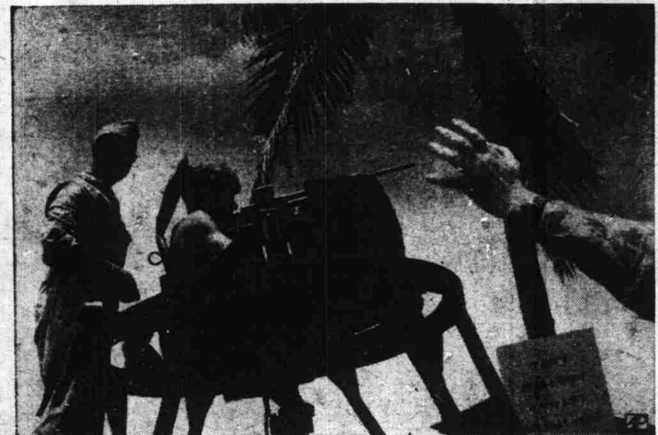
GETTING 'THAT SWING'—Bearing in mind the advice on the sign, a Navy air crewman gets gunnery instruction from a mobile training unit officer in the New Hebrides.