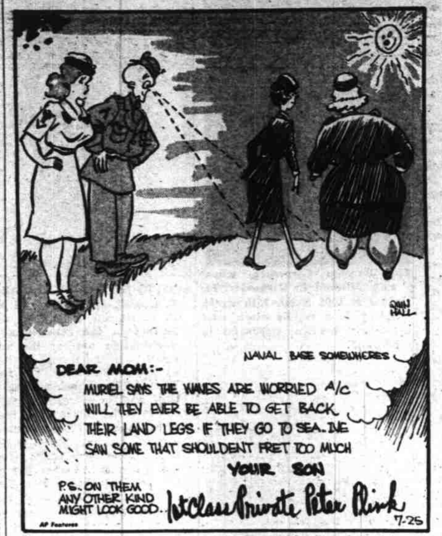
DEAR MOM:—MURKIN'S THE WIVES ARE WORRIED A/C WILL THEY EVER BE ABLE TO GET BACK THEIR LAND LEGS IF THEY GO TO SEA. HE SAW SOME THAT SHOULDN'T FREET TOO MUCH YOUR SON