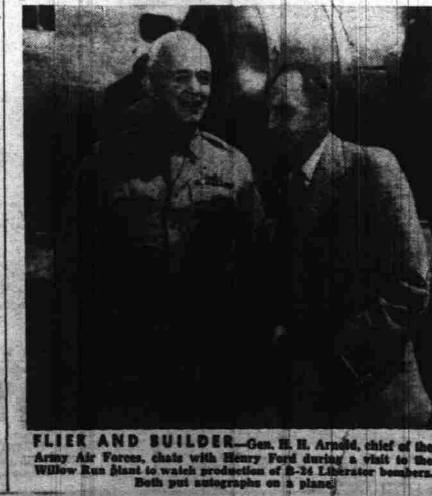
FLIER AND BUILDER—Gen. H. H. Arnold, chief of the Army Air Forces, chats with Henry Ford during a visit to the Willow Run plant to watch production of B-24 Liberator bombers. Both put autographs on a plane.