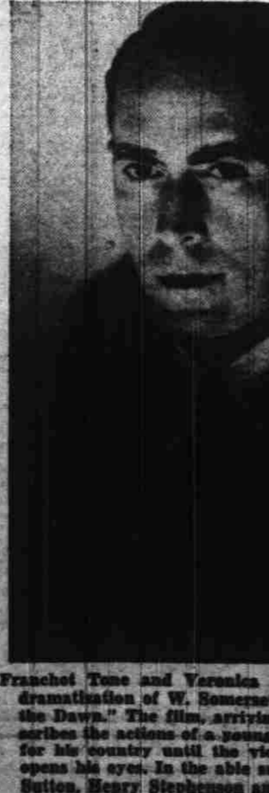
Franchet Tuna and Yarns Lake co-star in Paramount's stirring dramatization of W. Somerset Maugham's novel, "The Hour Before the Dawn"...

Each doctor treats your hemorrhoids—fissures—fistulae—using the most advanced—scientific—method. He uses the most powerful—yet—gentle—method. He guarantees you relief. He guarantees you a permanent cure. He guarantees you a permanent cure. He guarantees you a permanent cure.