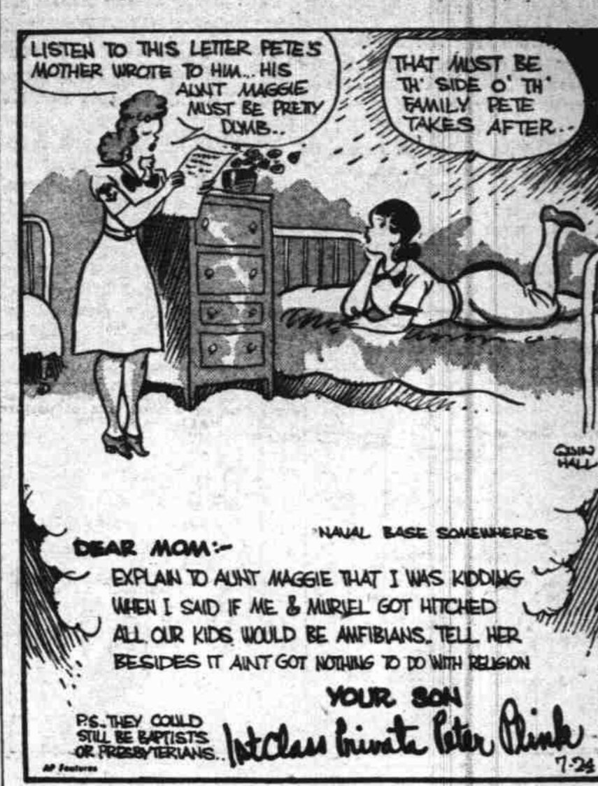
LISTEN TO THIS LETTER PETE'S MOTHER WROTE TO HIM... THAT MUST BE 'N' SIDE O' 'N' FAMILY PETE TAKES AFTER...