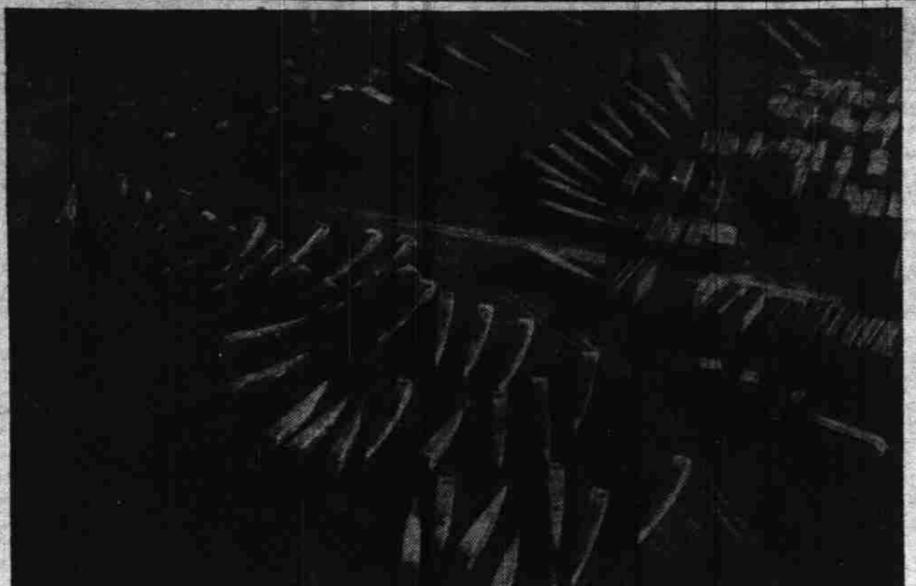
GLIDERS AWAIT THEIR WINGS—Unassembled gliders of the Ninth U. S. Air Force in Britain await their wings at a field where invasion preparations are under way.

Mrs. Marjorie Weaver and Milburn Stone share countless pearls in the thrilling serial, "The Great Alaskan Mystery," first chapter of which will be seen on the Saturday matinee program at Warner's Esplanade theatre. The serial will be a regular additional attraction on Saturday matinees thereafter.