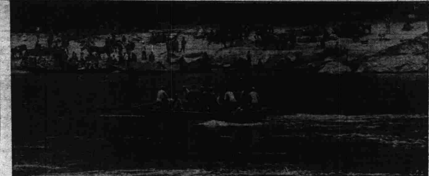
CROSSING THE SALWEEN—American soldiers, aiding Chinese forces battling the Japs, cross the Salween river in small boats to press their drive westward toward Burma. Not only troops but pack animals and all supplies had to be ferried.

HORIZONTAL form classifies got well garland upon stripings international language varnish ingredient tows swamp English school lamprey toward the sheltered side Spanish gentlemen wooden shoes pedal extremity legal science exhausts most constemptible sunburns high hill eggs high, in music braves VERTICAL thing, in law legislative body exclamation of triumph entire amount form of fuel whirlpools & rapids native metals blooms midday (pl.) disgrace primary color wing the theater whitest gases fixedly buffet moves stealthily river-lucks worthless scrap trick location vehicle meadow symbol for calcium exist Answer to yesterday's puzzle: POT PACT ASIA ARE ARRESTING RIND MANIA TE UNDER TOT MEN SO EELER PART ECU EAR CON DONALD GUITAR INS CUB AVE SPOT PONES AS TEN TAU SPORT RA MANE ARIA ACCORDING ACT WEEP ANSA LEE Average time of solution: 24 minutes. Dist. by King Features Syndicate, Inc.