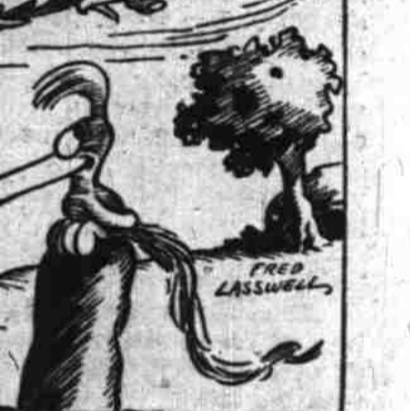
ONCE YOU KETCH IT