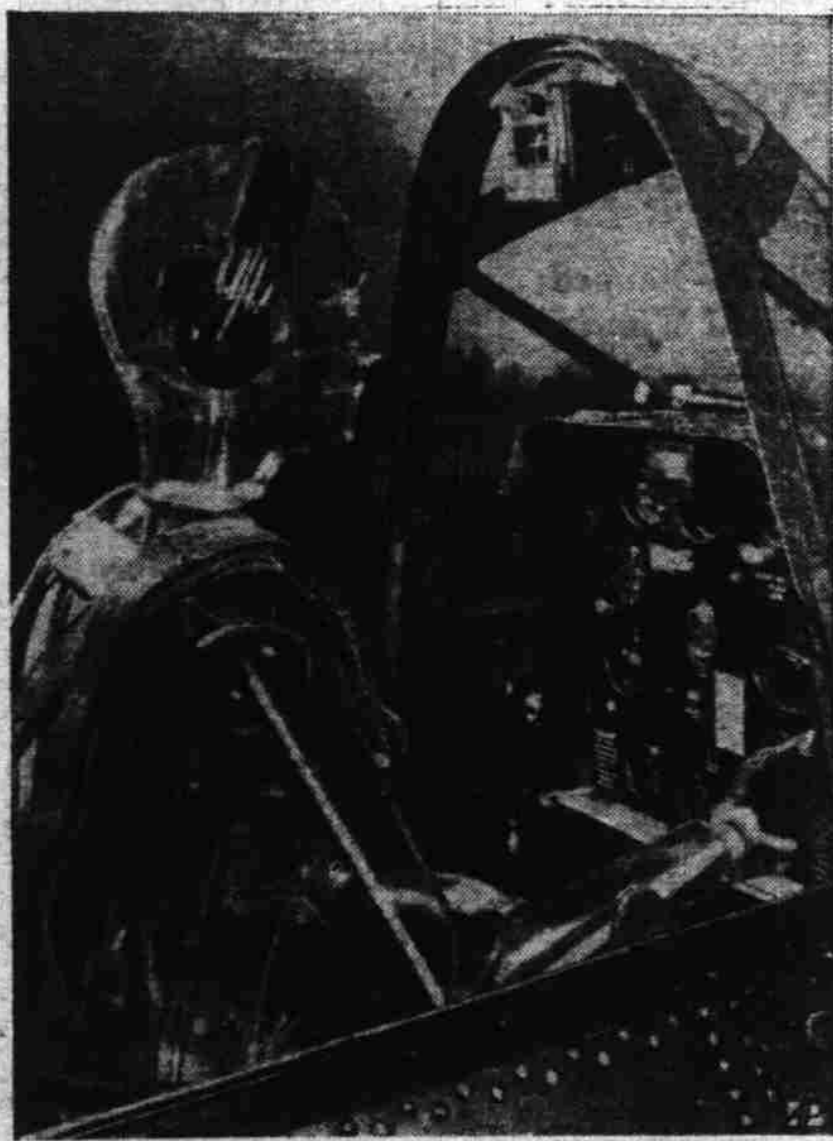
PLASTIC WASP IN PLANE. —This plastic figure of the average WASP, designed by the sculptor, G. W. Borkland, and made of "plastacel," a cellulose acetate plastic, is used to figure internal clearances and seat adjustments in planes for the AAF. The manikin is shown at the controls of a training plane at Chicago municipal airport.