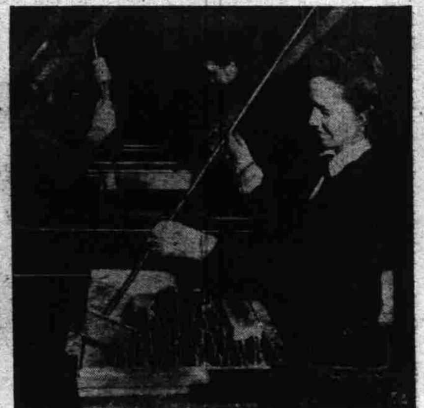
SILVER SOLDER FOR BOMBS. —A woman worker in the war plant of Handy & Harman, Detroit, uses a special silver solder on part of an oil bomb dropped by the USAAF to start large fires. Only a tiny amount of silver goes into each bomb, but more than 100,000 ounces have been consumed in this way.