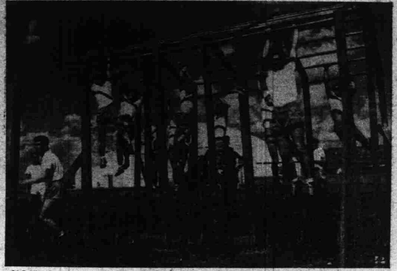
YOUNG TURKS IN TRAINING. —Young Turkish officers, taking training at the Army's San Antonio, Tex., aviation cadet center, go through part of the obstacle course.