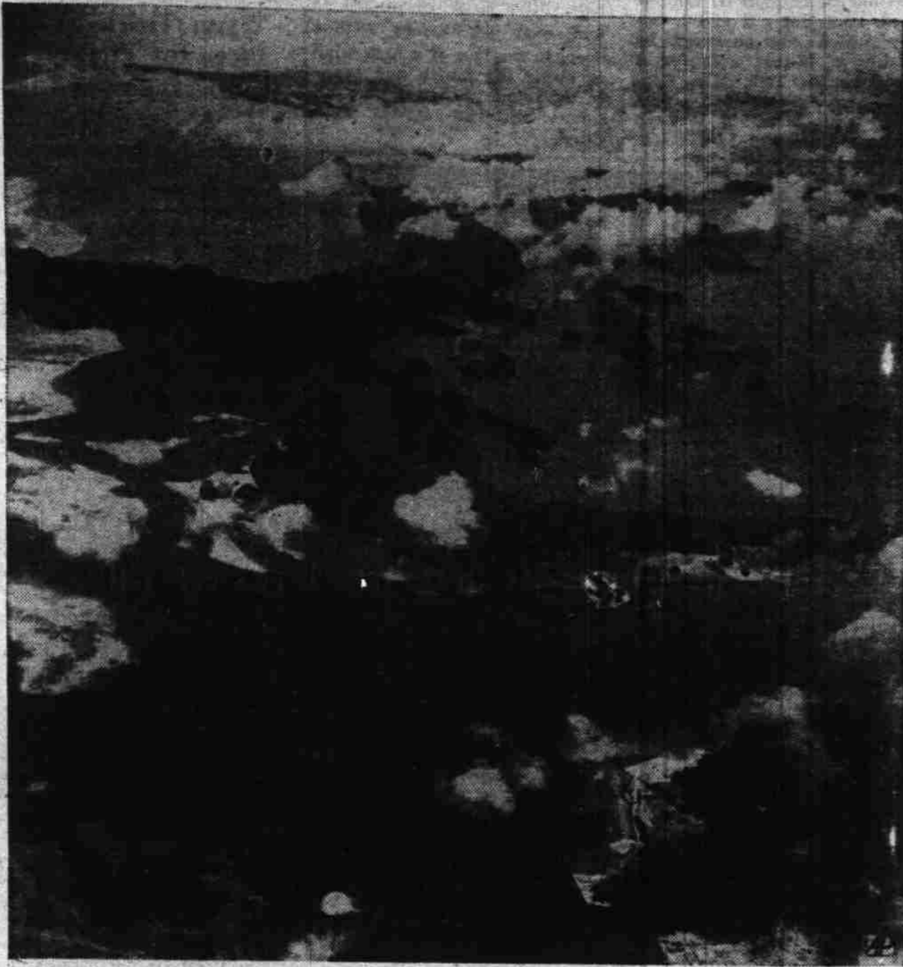
CLOUDS—AND SMOKE—OVER PALAU. —Smoke rises from Jap buildings and ships as Navy carrier-based planes attack the enemy stronghold in the southwest Pacific.