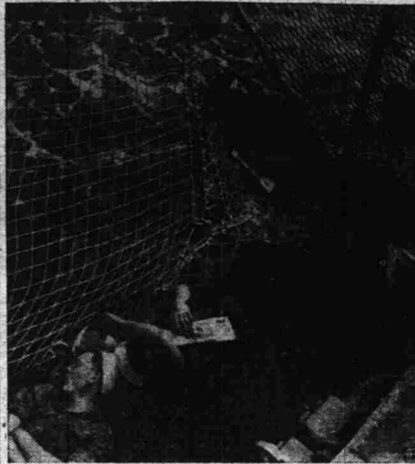
ASLEEP ON THE DEEP. —Nets of a catwalk on a Navy aircraft carrier form "hammocks" for these crewmen catching a few winks while off duty. Note man at right, a "talker," wears headphones and mouthpiece even in his sleep.