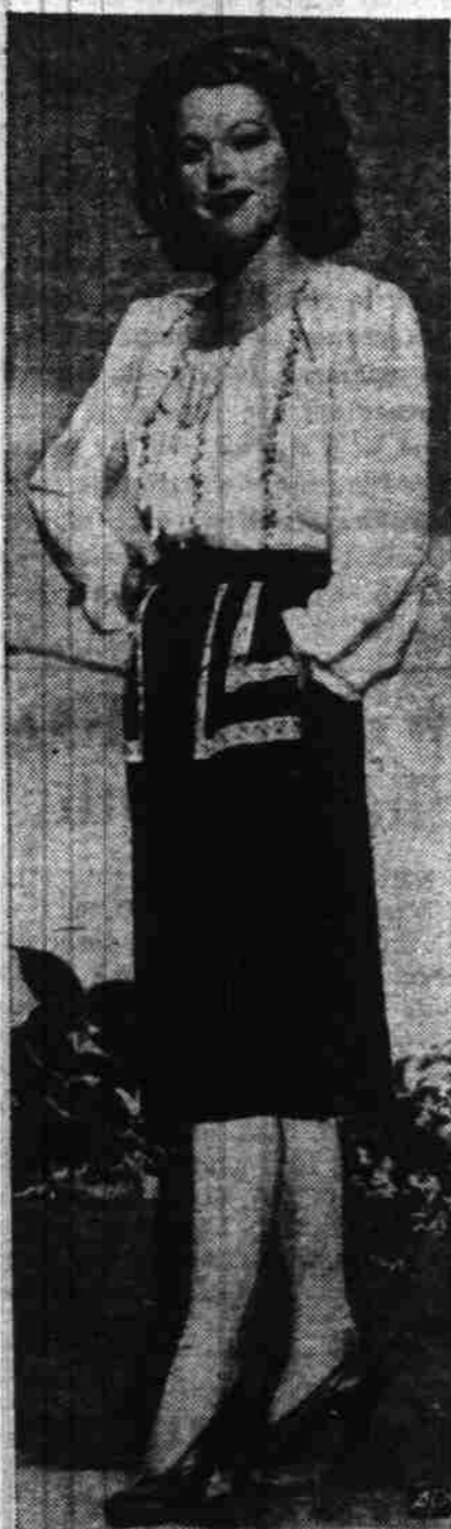
CASUAL. —Julie Bishop, film actress, models a casual two-piece dress with feminine long-sleeved blouse styled with a drawstring neckline. The black skirt is shirred with a fitted waistband. Bright colored braid is used to trim both pieces.