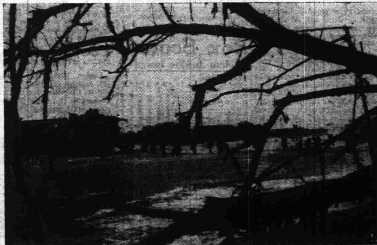
YANKS DASH ASHORE. —Somewhere on the New Guinea coast Army troops plunge ashore from the ramps of LCI(L) boats to move another notch closer to Tokyo.