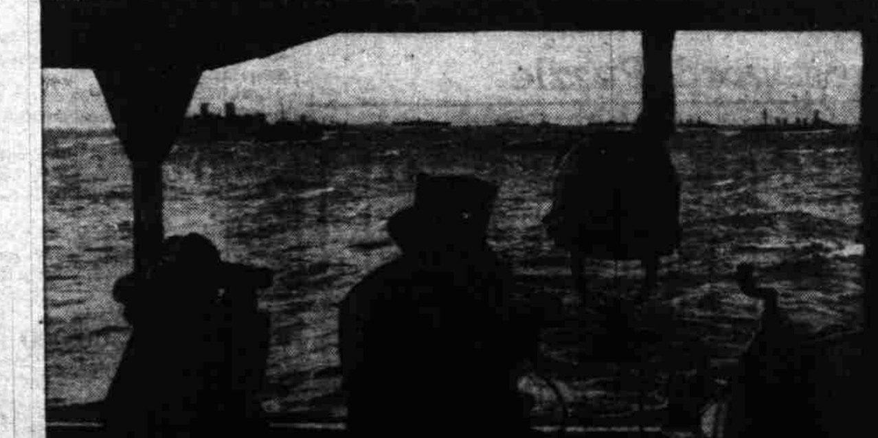
CARRYING INVASION SUPPLIES —Pictured from the bridge of a Coast Guard-manned assault transport, cargo and troop ships move eastward across the Atlantic.