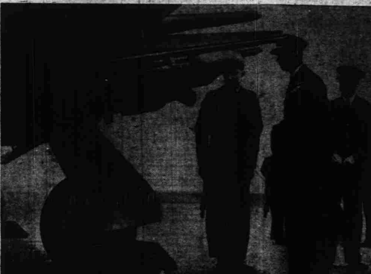
KING INSPECTS PLANE ROCKETS —At a Royal Air Force station somewhere in England King George VI inspects a Typhoon fighter fitted with rocket projectile apparatus.