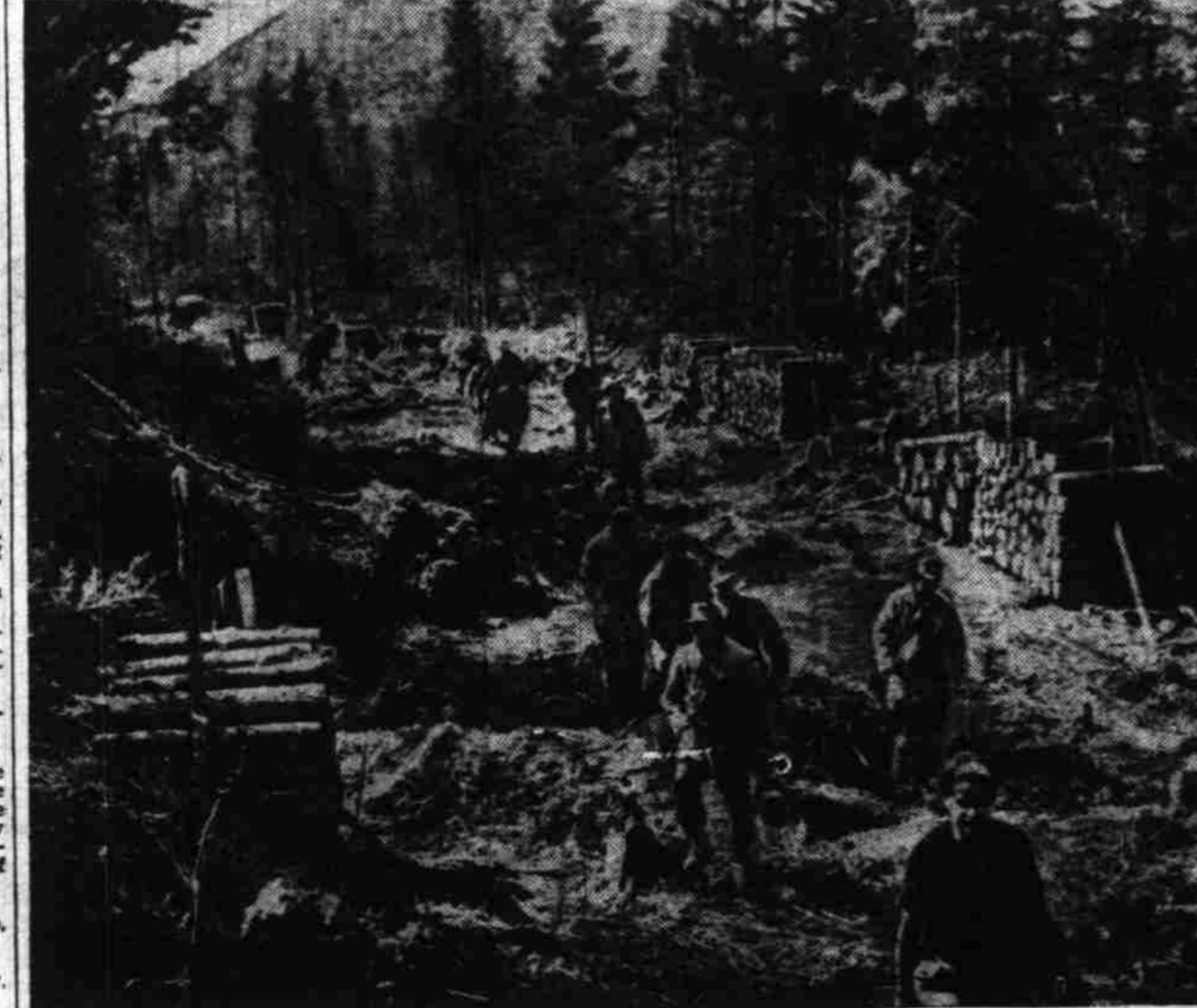
PRISONERS CUT WOOD —German prisoners of war file through a clearing at their wood cutting site at Camp Stark, N. H., where they are employed in timber operations.