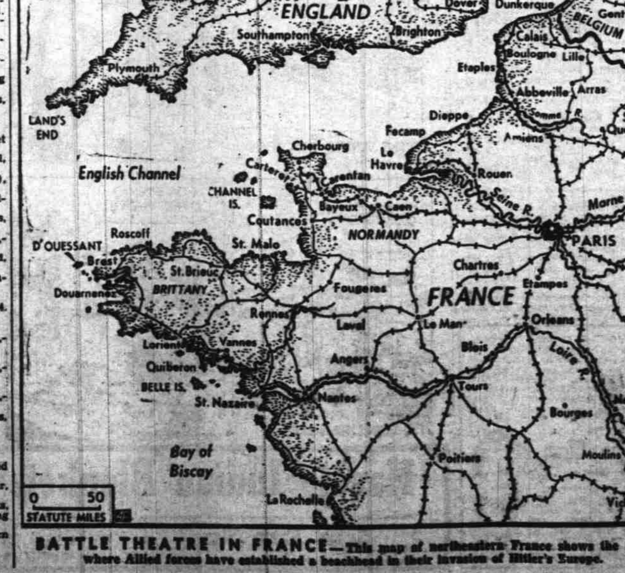
BATTLE THEATRE IN FRANCE —This map of northeastern France shows the area where Allied forces have established a beachhead in their invasion of Hitler's Europe.