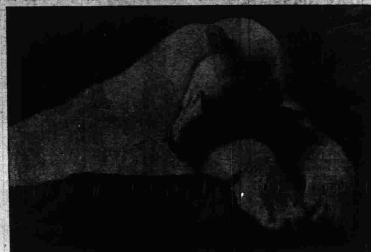
RETIRED —Veiox, retired circus performer, smooches in the spring sunlight in the Denver zoo. Taught by a French trainer, the polar bear obeys only French commands.