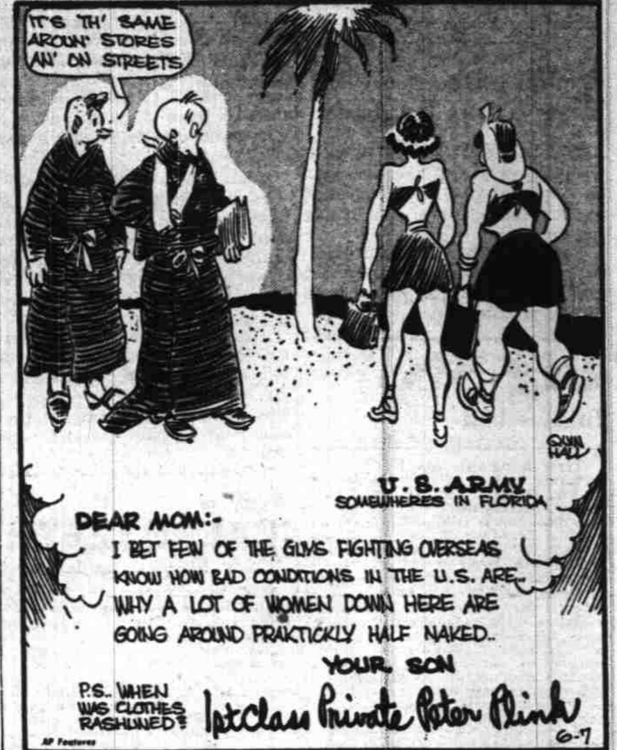
U.S. ARMY SONGWOMEN IN FLORIDA

DEAR MOM: I bet few of the guys fighting overseas know how bad conditions in the U.S. are. Why a lot of women down here are going around practically half naked.