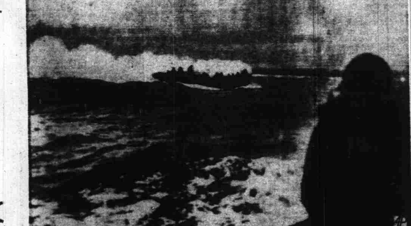
Burns on French Coast—Smoke streams from a US coast guard landing boat approaching the French coast after German machine gun fire caused an explosion by setting off an American soldier's hand grenade.

Youths, who must enlist in the army enlisted reserve corps before July 1 and be between 17 and 17 years, 9 months, will be inducted following schooling in some college approved by military authorities.