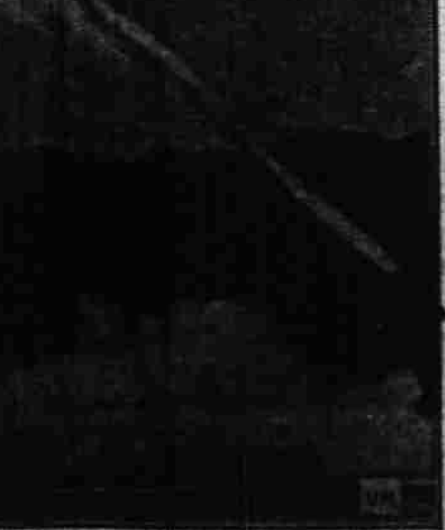
Recent Nazi air attacks on England have met with salvos of rockets from batteries of new secret guns. Like those shown in this picture. These guns are the result of years of research by British scientists. They are just one more example of the United Nations' ingenuity in producing new weapons against the foe.