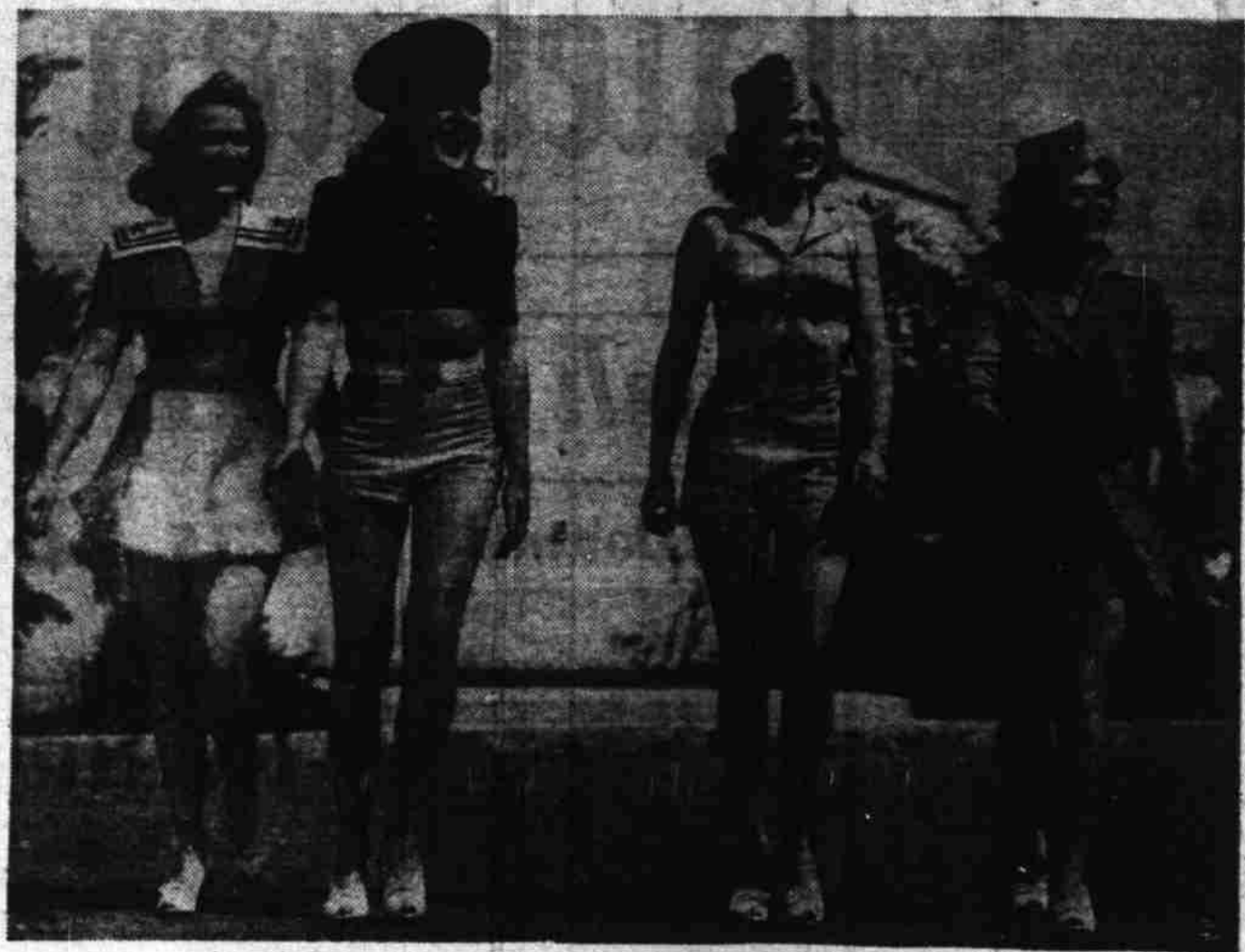
Hello, Boys! Film Stars Martha Driscoll, Evelyn Ankers, Anne Gwynne and Grace McDonald (left to right) play no favorites when it comes to service men's "pin-up" pictures. The cuties are attired for the navy, marines, air corps and army, respectively.