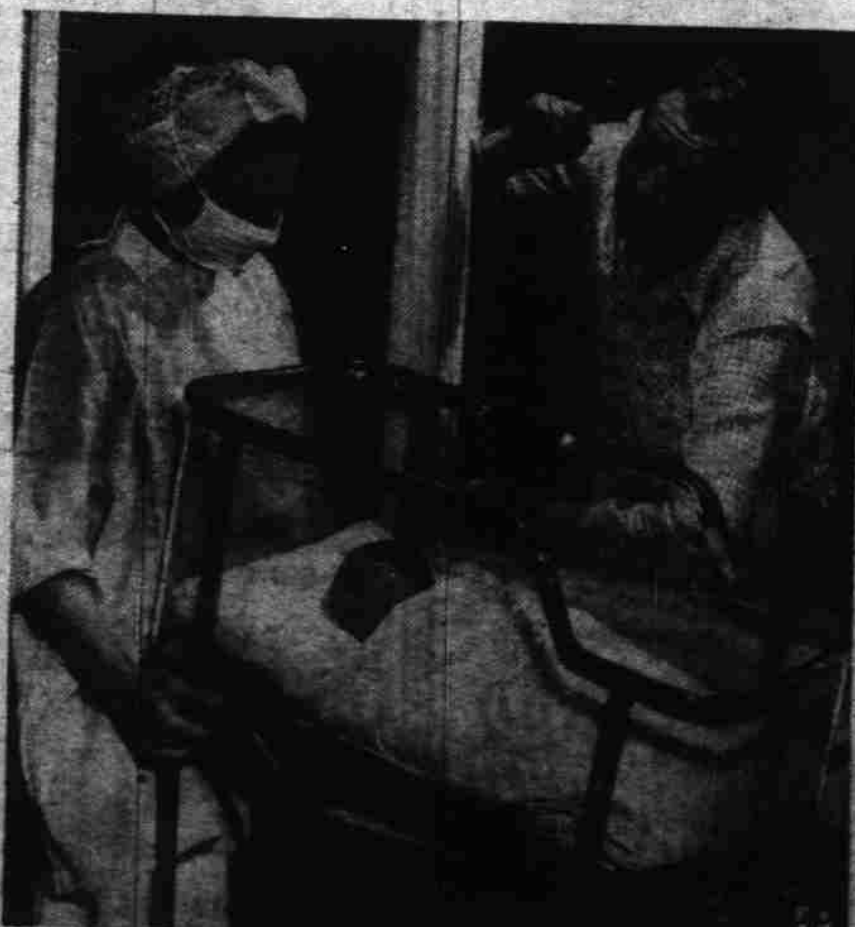
PROUD FATHER —Ed (Archie) Gardner, comedian, seems to have a little trouble attracting the attention of his son, a recent arrival at a Santa Monica, Calif., hospital.