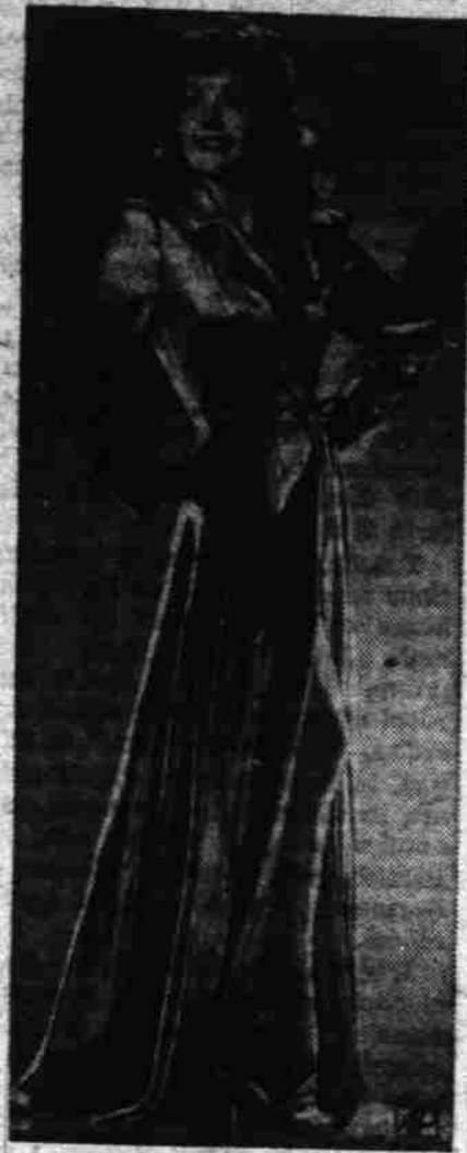
SLEEK —Lynn Bari, svelte motion picture actress, shows off an alluring satin dressing gown.