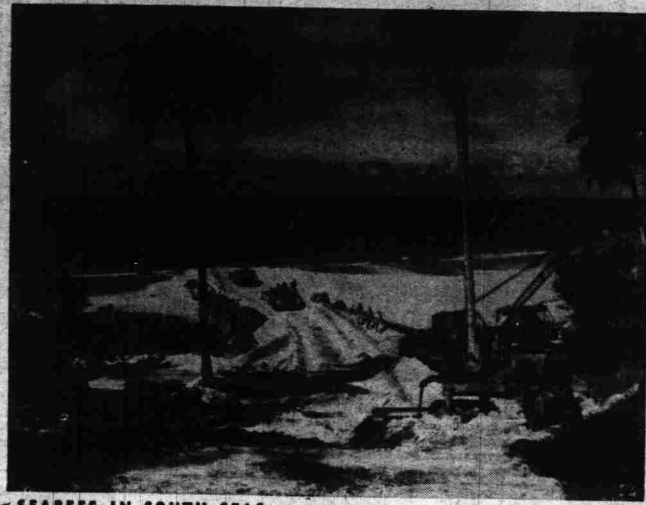
SEABEES IN SOUTH SEAS —Using bulldozers, U. S. Navy Seabees clear a road to a dock site on Emirau Island to facilitate unloading of LST's.