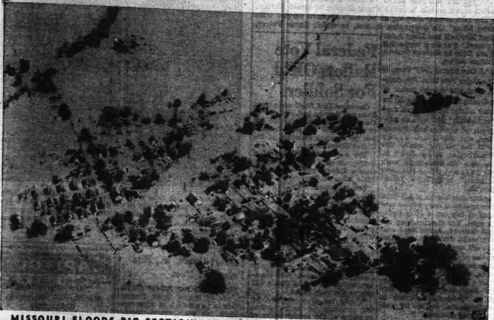
MISSOURI FLOODS BIG SECTION —Flood waters of the Missouri river completely surrounded this low-lying section of Jefferson City, Mo. The main section of the city lies on higher ground.