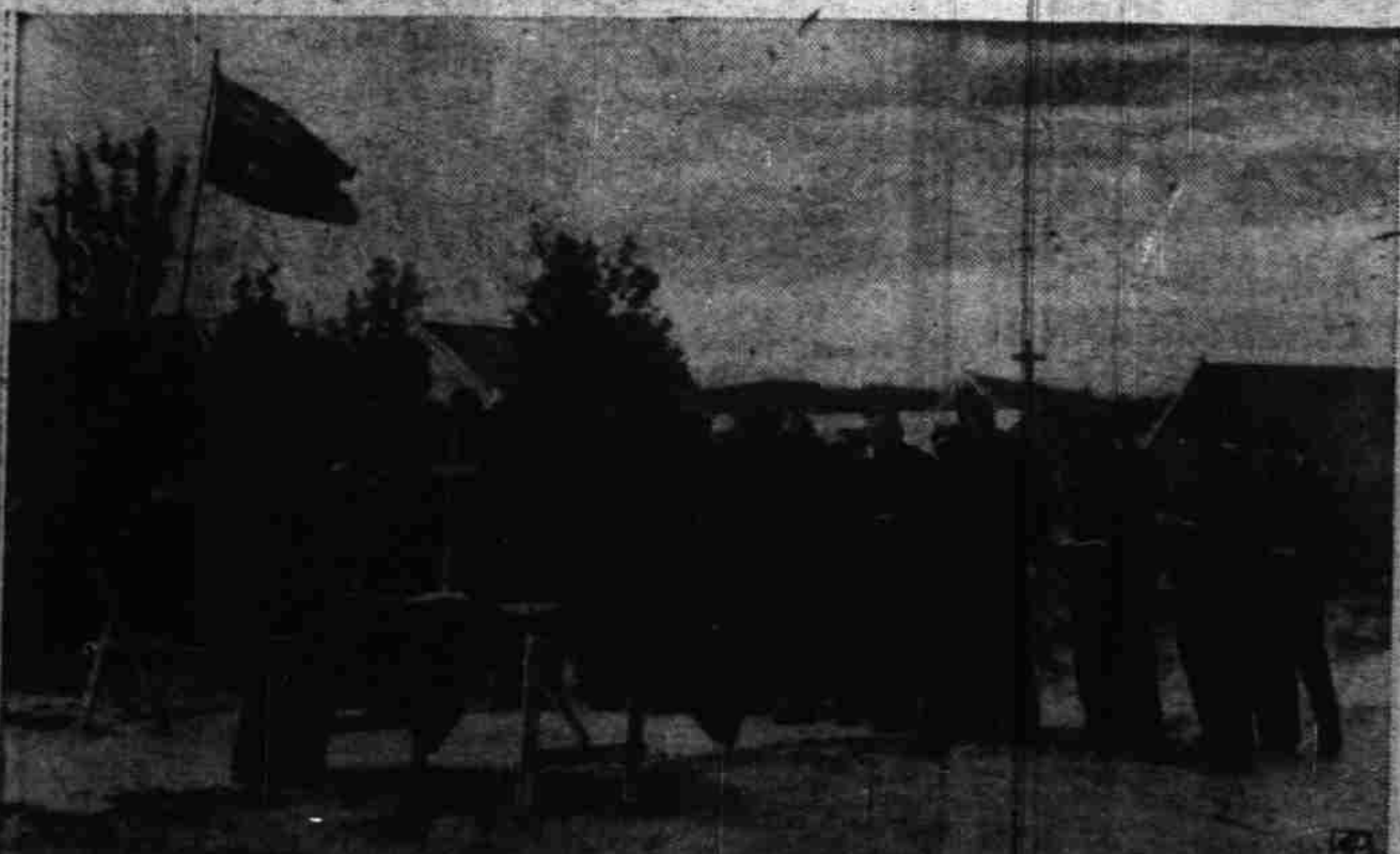
AIR FIELD SERVICE —While flying personnel was on a raid, ground crews of an EAAF unit in England attended religious services on the field to mark Ascension Day.