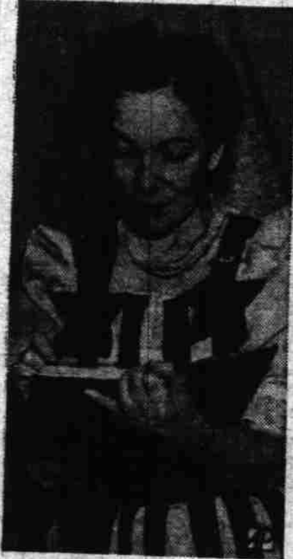
SIGNER —Actress Helen Hayes signs an autograph book in which Stage Door Canteen guest stars in New York will write their names—the book, filled with famous signatures, to be auctioned off to spur sales in the Fifth war loan drive.