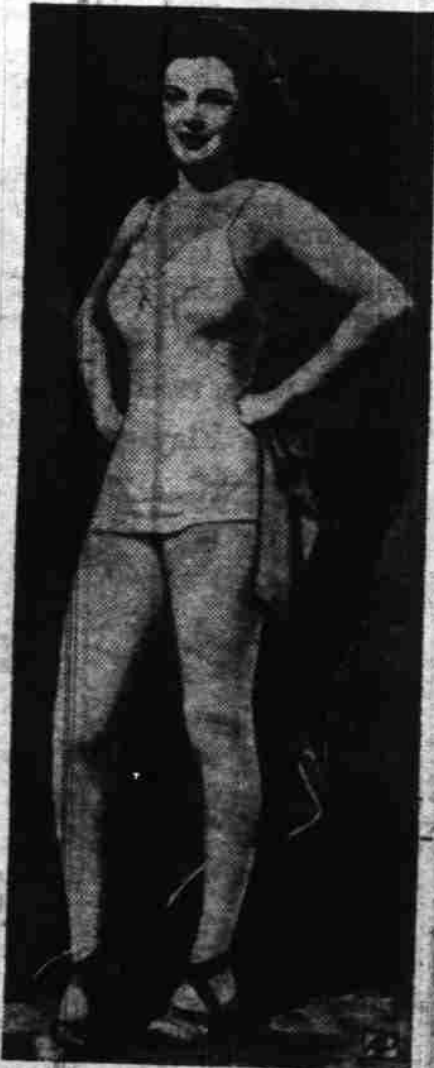
ACTRESS —Screen actress Marguerite Chapman dons bathing suit and sandals and gets all ready for the beach.