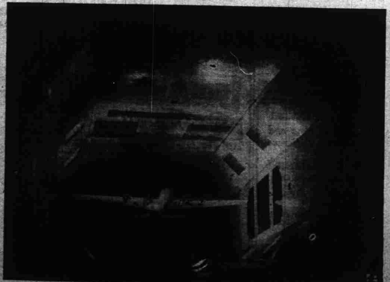
700-MILE-AN-HOUR TUNNEL —Flying Fortress model is shown being subjected to high-speed tests in new Boeing wind tunnel at Seattle, capable of developing 700 m.p.h. winds.