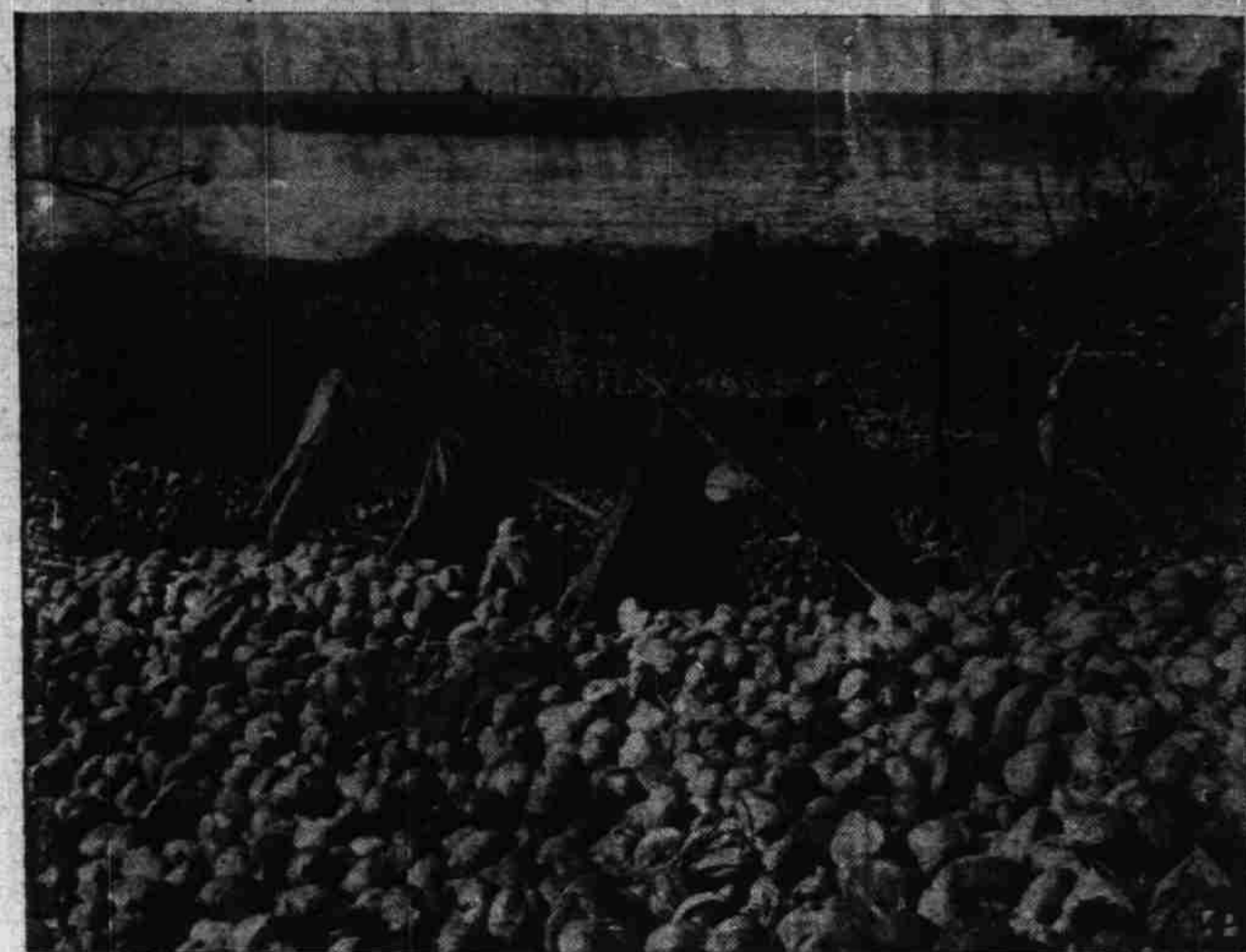
NEW HEBRIDES NUTS —U. S. service men don't go much for coconuts, and left this impressive pile on Espiritu Santo for French and native coconut fanciers.