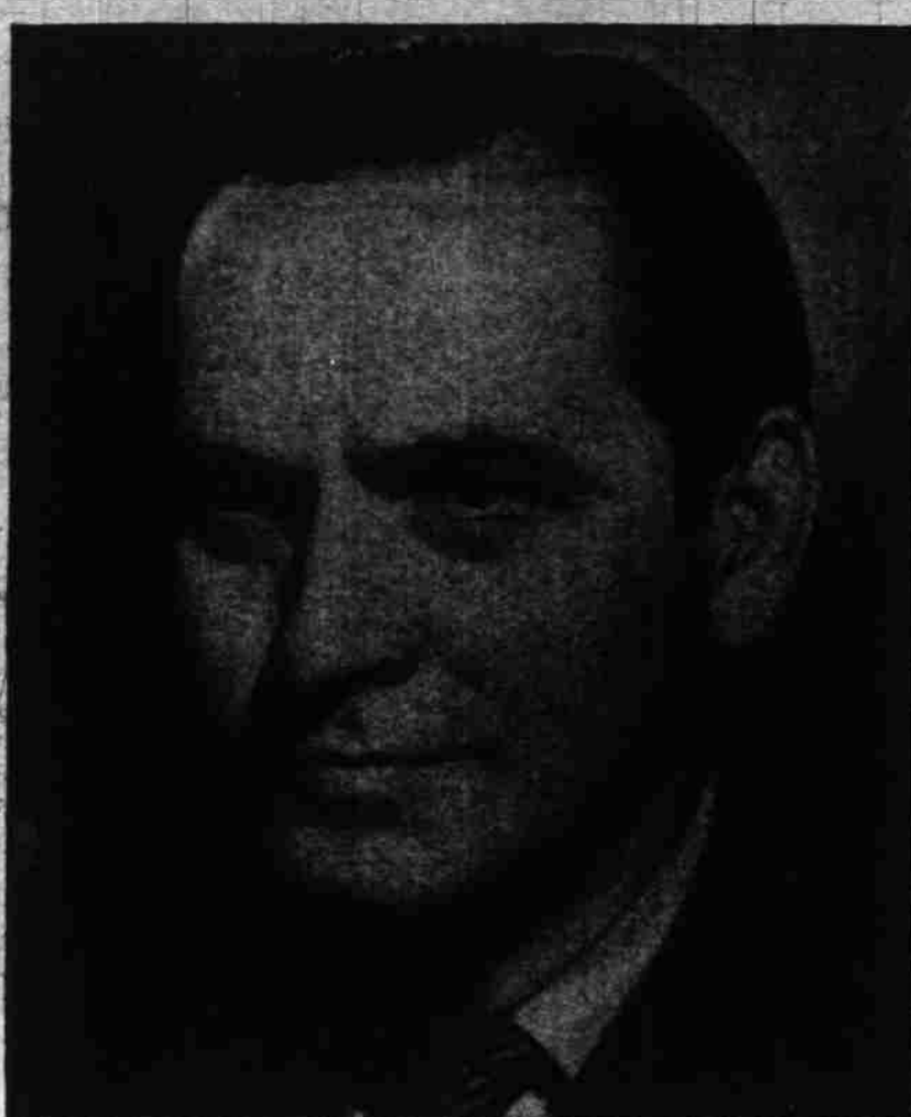
Fredric March is starred with Alexis Smith in the Warner Bros. production of "The Adventures of Mark Twain," opening Friday at the Elsinore theatre. March is cast as Mark Twain.