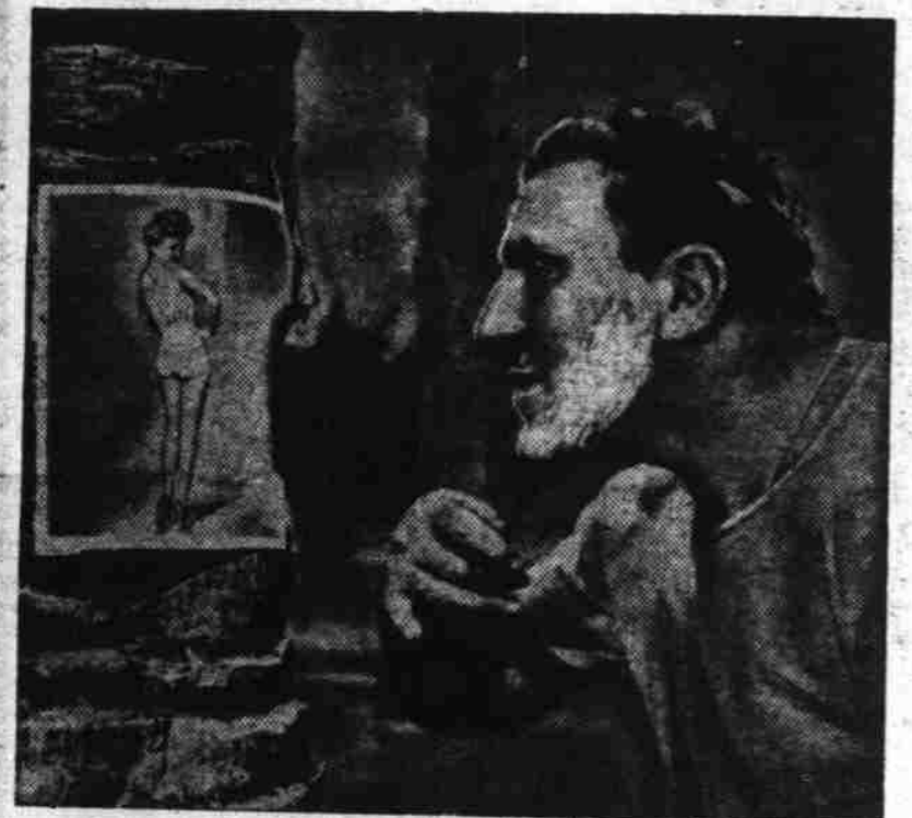
M-m-m-m, Betty Grable! William Bendix as "Taxi" in 20th Century-Fox's filming of Richard Tregaskis' "Guadalcanal Diary," takes time out from worrying Japs for a refreshing glimpse of America's No. 1 pin-up girl. Preston Foster, Lloyd Nolan, Richard Conte and Anthony Quinn are also featured in the picture which is showing now at the Capitol theatre. On the same big program Mae West, Victor Moore and William Gaxton appear in the music-comedy, "The Heat's On."