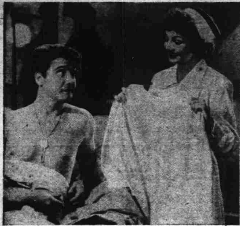
Paramount's "So Proudly We Hail," the picture about army nurses and their lives and loves under fire, now playing at the Hollywood theatre. The film stars Claudette Colbert, Paulette Goddard and Veronica Lake, and also introduces two new male stars, one of them George Reeves shown above, the other Sonny Tufts. Tufts is seen as Miss Goddard's romantic interest, and the role marks the tall blond's motion picture debut. Also on is the famous Al Pearce show, in "Here Comes Elmer."