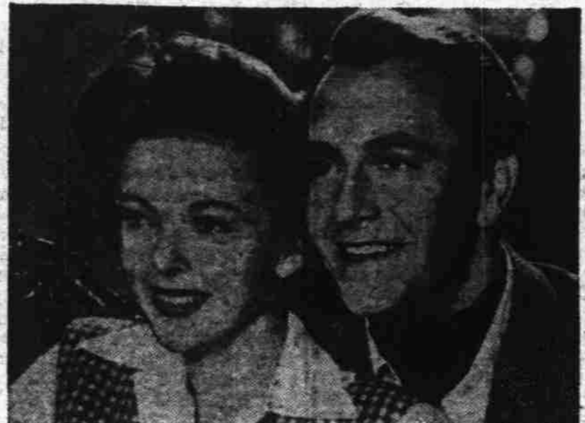
Ida Lupino and Paul Henreid in a romantic scene from "In Our Time," Warner Bros. latest drama, with Nancy Coleman and Mary Boland, now at the Grand.