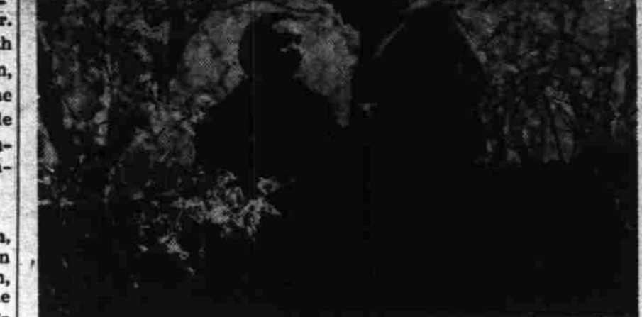
Poignant scene from Franz Werfel's "The Song of Bernadette," new Fox sensation with Jennifer Jones, William Eythe and Charles Bickford, starting today at the Grand.