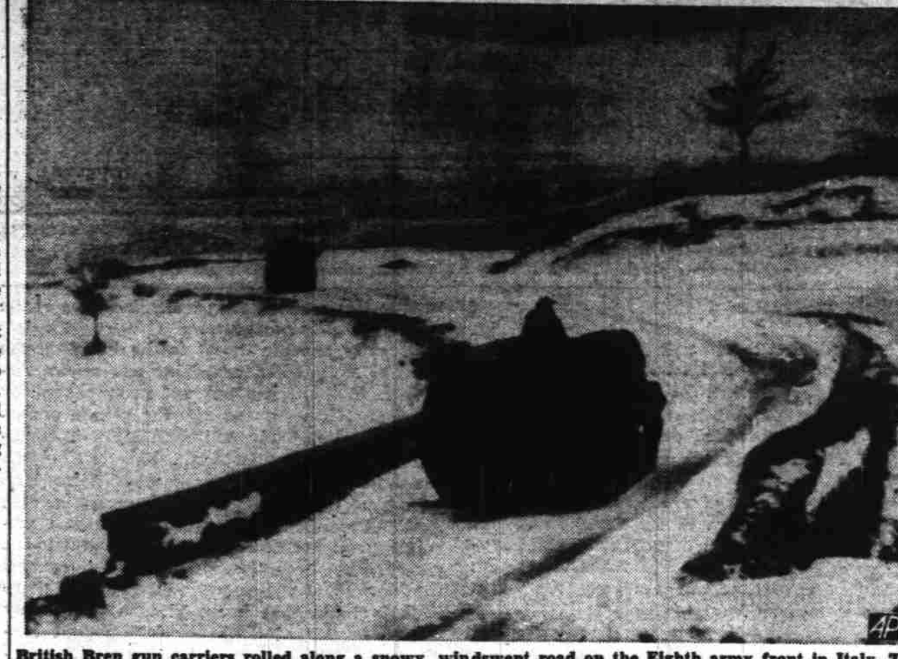
British Bren gun carriers rolled along a snowy, windswept road on the Eighth army front in Italy. This is a British official photo.