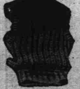
Ribbed all-wool sweater.