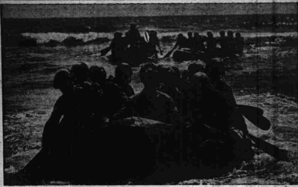
Coming ashore from two giant submarines in rubber landing boats, are these brave marine raiders, in this scene from the exciting film "Gung Ho" which is now showing at Warner's Elsinore theatre. Randolph Scott plays the leading role, the screen prototype of Colonel Carlson. The Andrews Sisters star in "Swingtime Johnny," companion feature of the program.