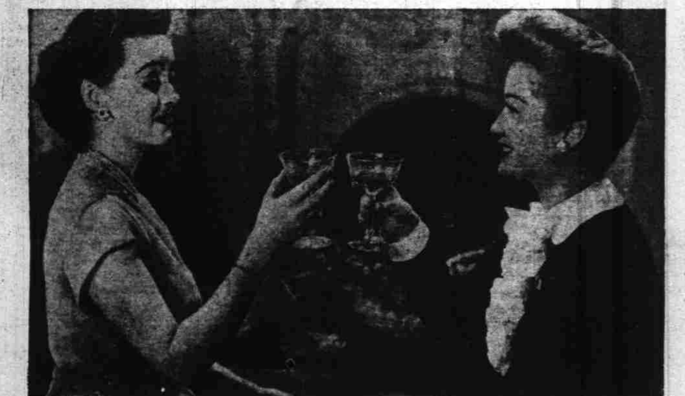
And nothing is more assured for Bette Davis and Miriam Hopkins after their performances in Warner Bros. "Old Acquaintance," a highly emotional picture which required the great talents of these two actresses—and they have given excellent performances. This feature backed by the funniest comedy in years, "True to Life" with Mary Martin, Franchot Tone, Dick Powell and Victor Moore is showing now at the Capitol theatre.