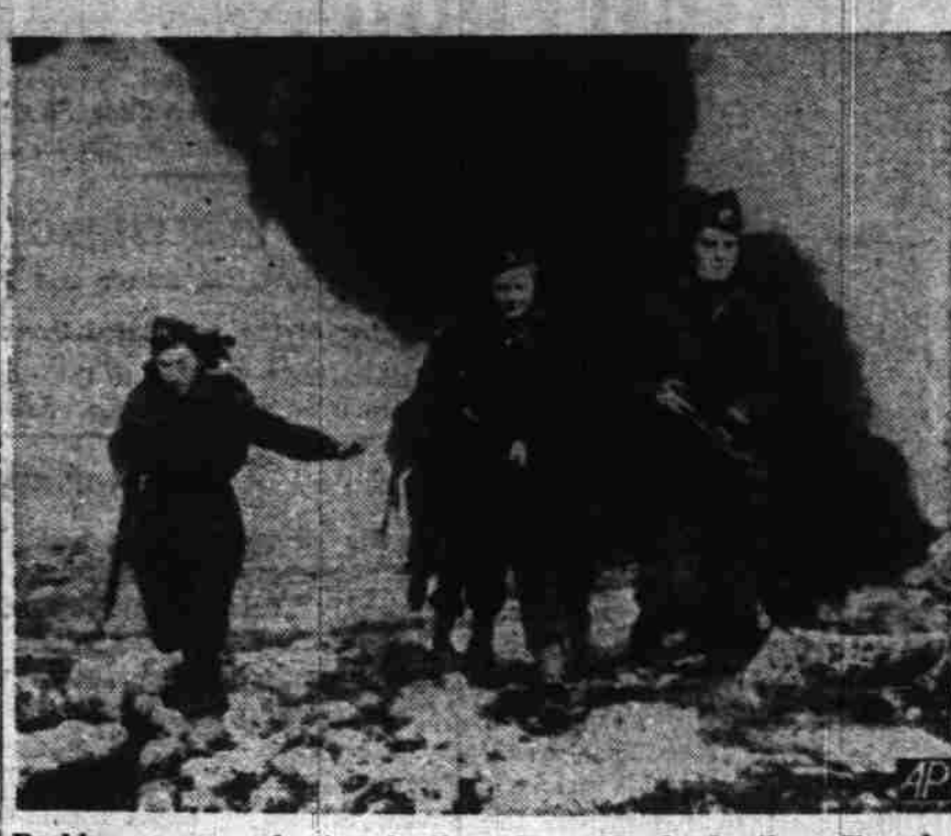
Dashing across rocky terrain through smoke clouds, these Yugoslav women train at Bari, Italy, for service in General Tito's partisan army, according to OWI which released the picture in Washington. They fight shoulder to shoulder with men. All of these women are recovering from wounds received in previous guerilla fighting.