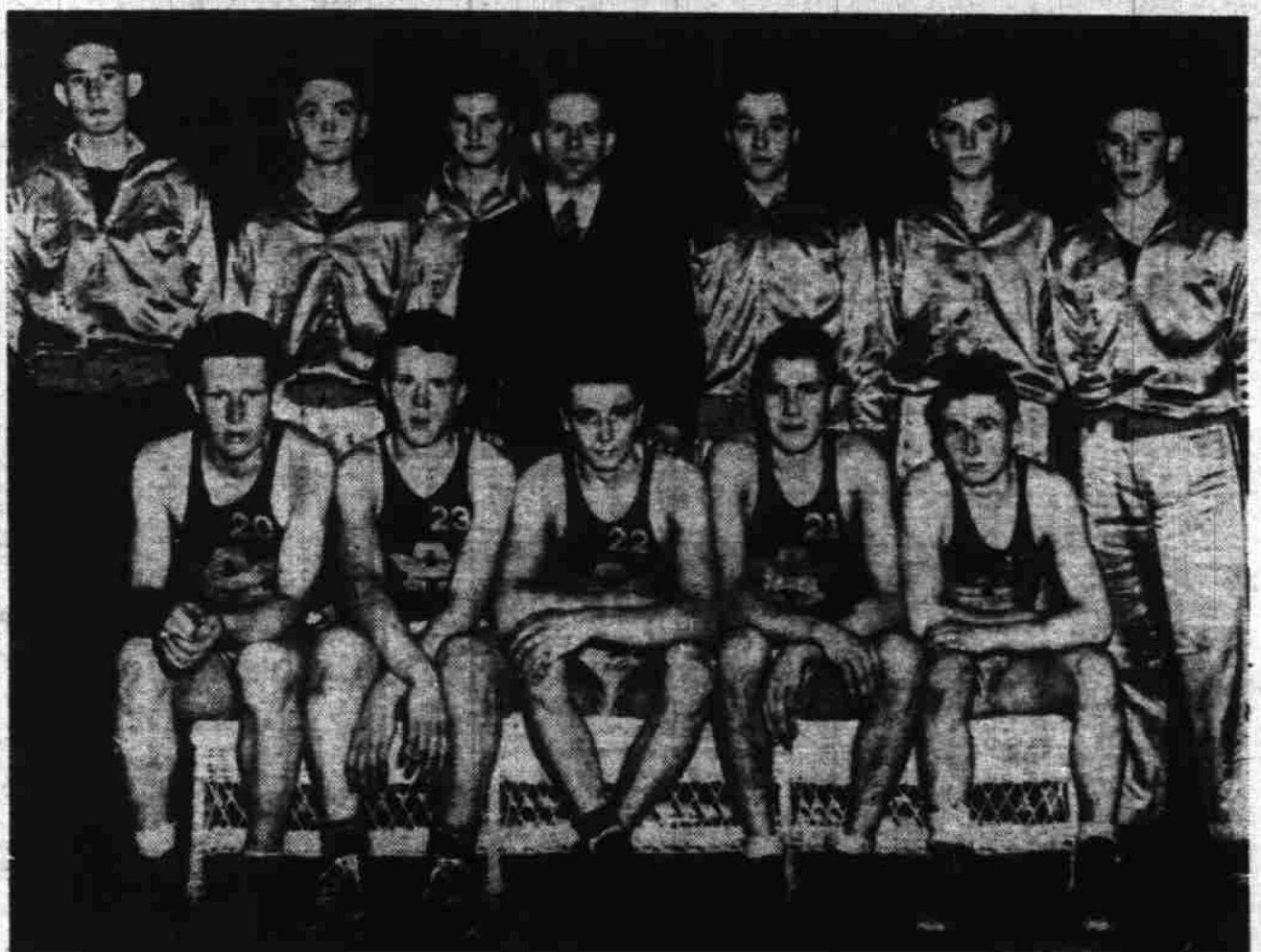
At. Angel's Preps, winners of two straight district 4 games come down from the hills tomorrow night to scrap it off with the Dallas Dragons on the Salem floor for the right to play Corvallis for the district's tournament berth.