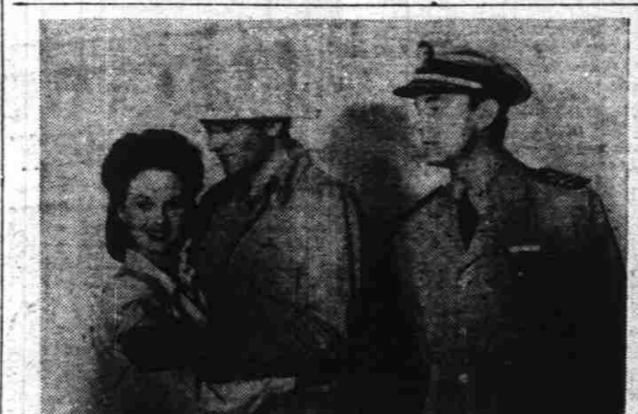
"The Fighting Seabees," a tale of the navy's hard-working, hard-fighting, hard-loving battalion with John Wayne, Dennis O'Keefe, Susan Hayward, is now showing at the Grand.