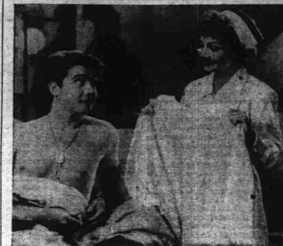
George Reeves, Paramount's new male heart-throb, tries to talk love-ly Claudette Colbert out of bathing him in "So Proudly We Hail" which is now at the Capitol theatre. But Nurse Claudette has her way in this, and subsequent scenes. The picture co-stars her with Paulette Goddard and Veronica Lake. Sonny Tufts, another new male find, is also in the film, as is Walter Abel. Companion feature on the bill is "After Midnight With Boston Blackie" starring Chester Morris.