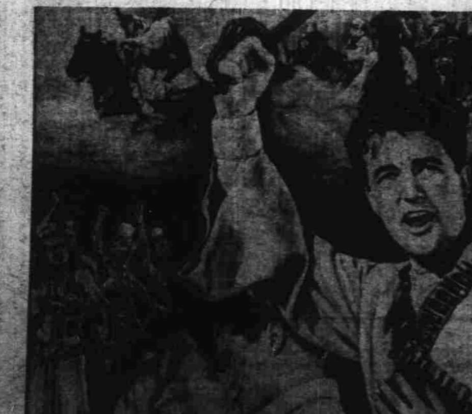
Brought together for Warner Brothers technicolor production of "The Desert Song" where the accent is definitely on action and music, Dennis Morgan and Irene Manning have their first opportunity to do what Hollywood has long denied them—sing. Joan Davis is beautiful but broke in the companion on the program now showing at the Elsinore theatre.