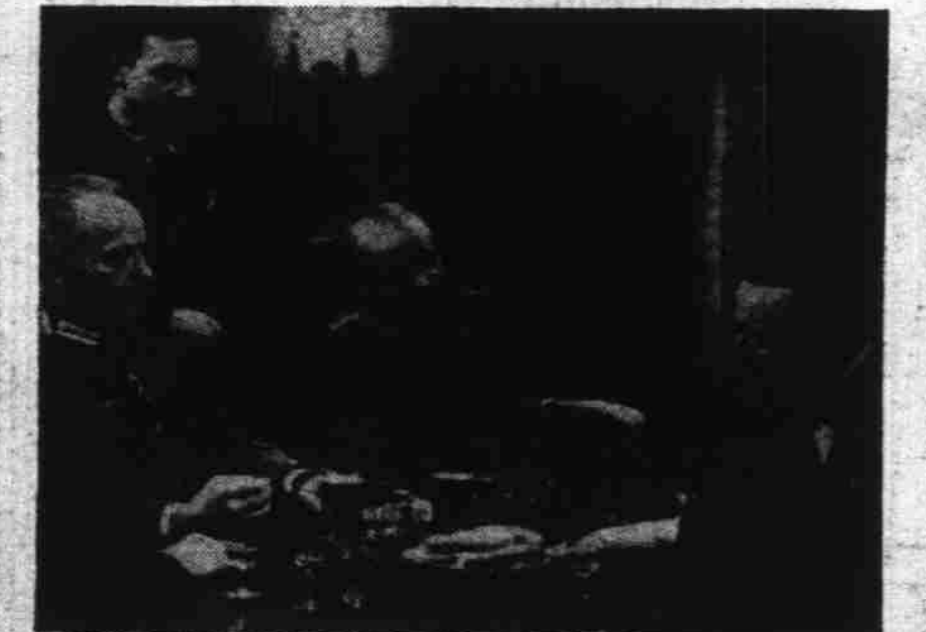
Leslie Howard explains to high officials the principles of his new design in aircraft in a scene from his picture "Spitfire" by Samuel Goldwyn. The second big hit is Bing Crosby co-starred with Dorothy Lamour in "Dixie," their swiftest and gayest musical hit of all! Both features appear Sunday through Tuesday on a double bill at the Hollywood theatre.

Academy Award winner! . . . The life story of George M. Cohan . . . American!