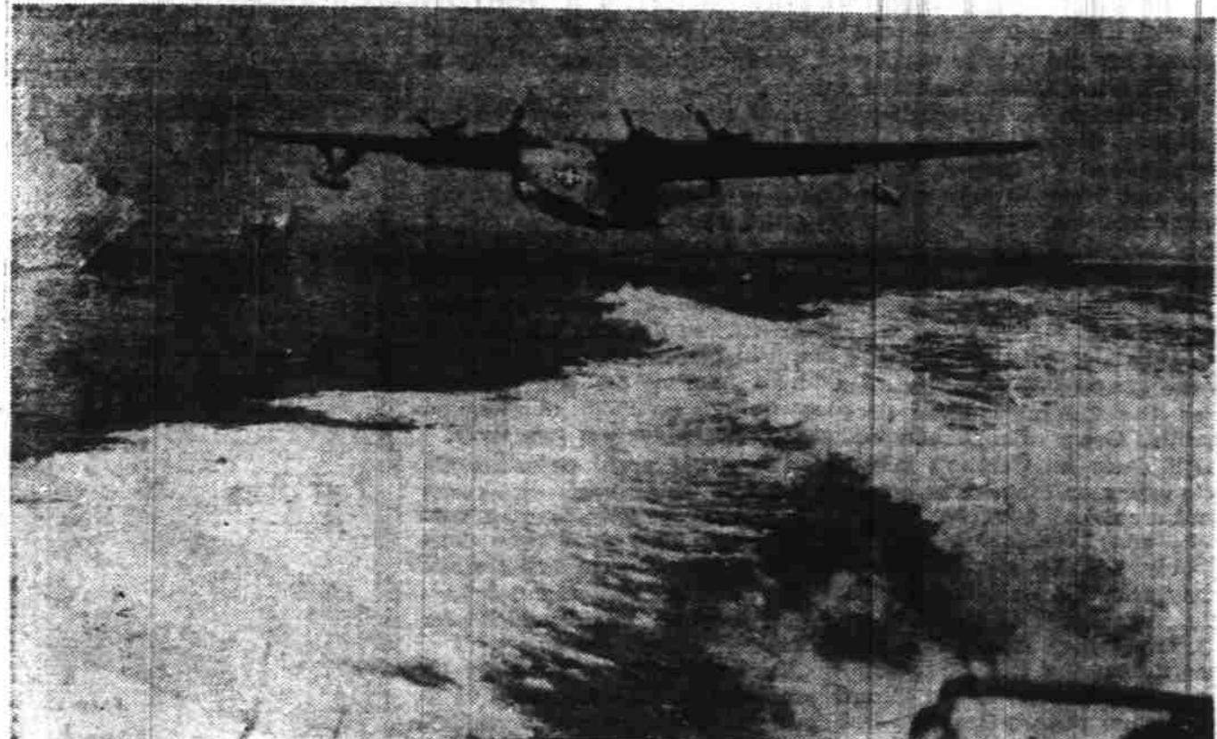
The aerial freighter Mars, largest flying boat in the world, is pictured as it took off from San Francisco bay January 22, lifting a 14,000-pound cargo, 20 passengers and 15 crewmen, and dropped down at Pearl Harbor, Hawaii, 13 hours and 18 minutes later. The navy has ordered 20 more to meet its heavy transport and supply demand in the Pacific. The ship is capable of lifting 150,000 pounds of freight and 175 passengers and crew. It has the capacity of a 15-room house, has a 200-foot span and ranges 175 feet from nose to tail.