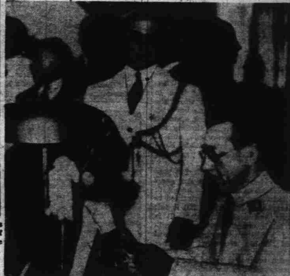
President Pedro Pablo Ramirez (seated), president of Argentina, speaks in a broadcast at Buenos Aires informing his nation of Argentina's breaking of diplomatic relations with Germany and Japan.