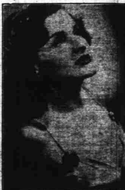
Constance Moore, fresh from her triumph in the Broadway hit, "By Jupiter," is portraying the highly desirable leading feminine role with Eddie Cantor in "Show Business," which the famed comedian is producing and starring in for RKO.