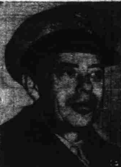
AIR CHIEF—This picture of Lt. Gen. George C. Kenney, USAAF, Allied air commander in the Southwest Pacific, was made when he made a recent visit to the White House.