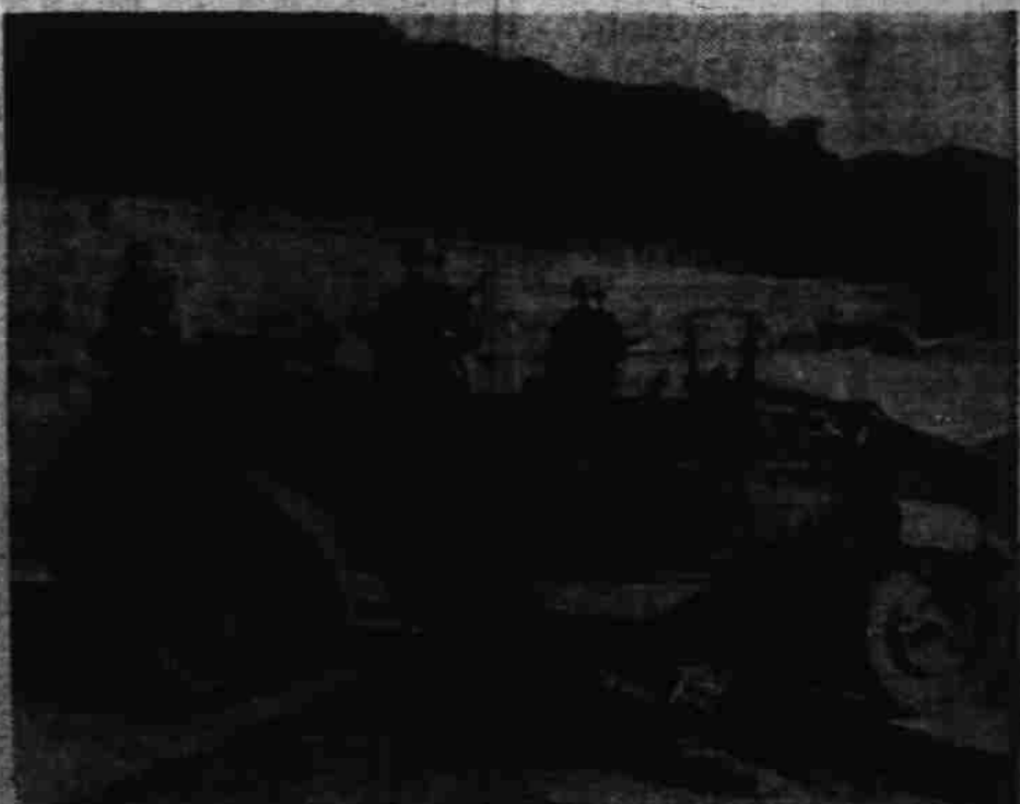
US Army troops advance cautiously along a street in Anzio, Italy, from which German forces were driven out after the latest allied landings south of Rome. A body lies alongside of the German counterpart of a jeep, in foreground.