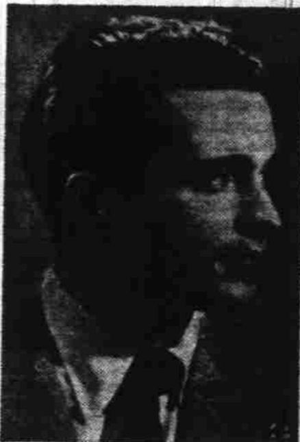
ROMANTIC—The gentleman with the classic profile is Perry Como, interpreter of popular songs who was voted in an annual poll the "most romantic singer" of the year.