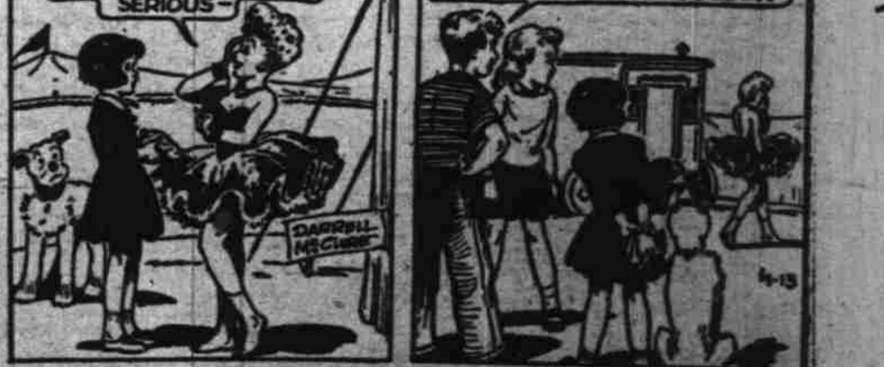
PLEASE DON'T APOLOGIZE — ACCIDENTS WILL HAPPEN