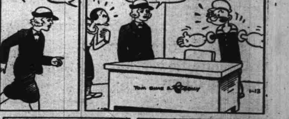
I WANT A SHIP — NOT A DESK