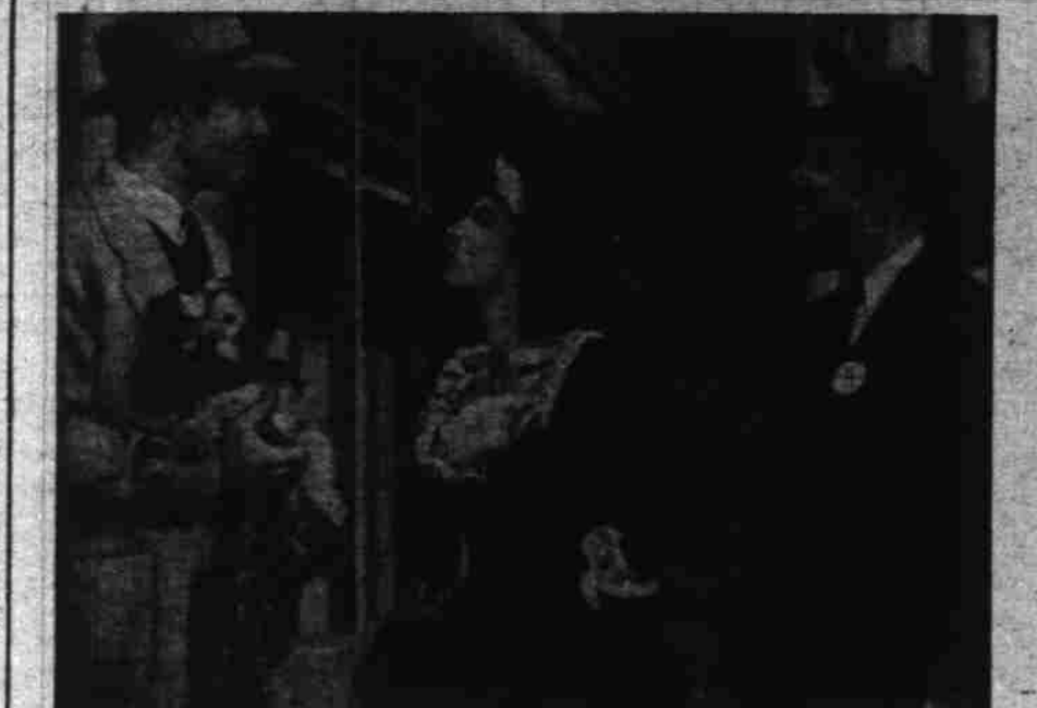
Butch, the trained peech, doesn't seem to mind a bit as Ann Sothern gives James Craig a piece of her mind in M-G-M's 'Swing Shift Maleie,' now playing at the Capitol theatre.