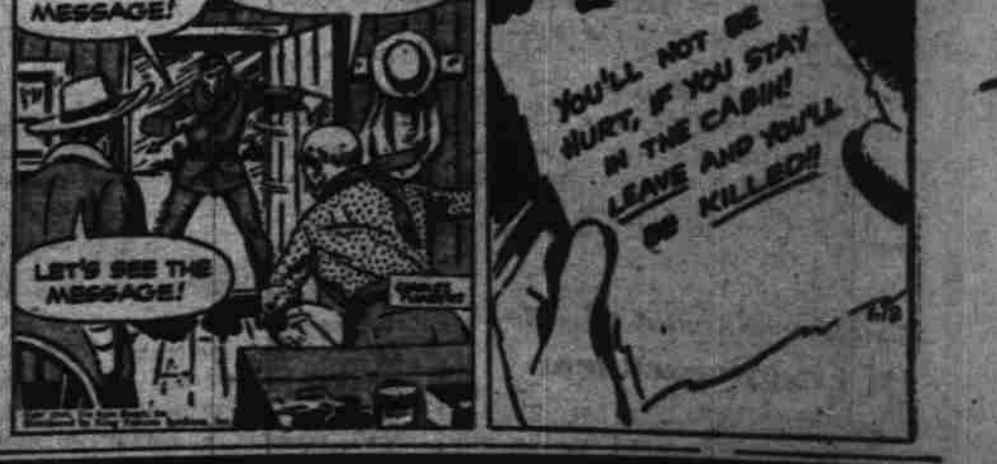
YOU'LL NOT BE HURT, IF YOU STAY IN THE CABINE