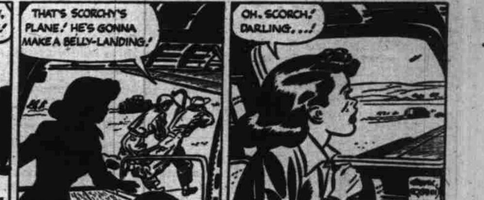
OH, SCORCHY, DARLING...