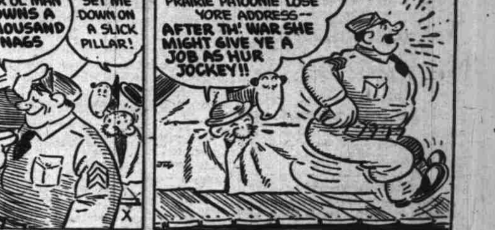
WAAH! SET ME DOWN ON A SLICK PILLAR!