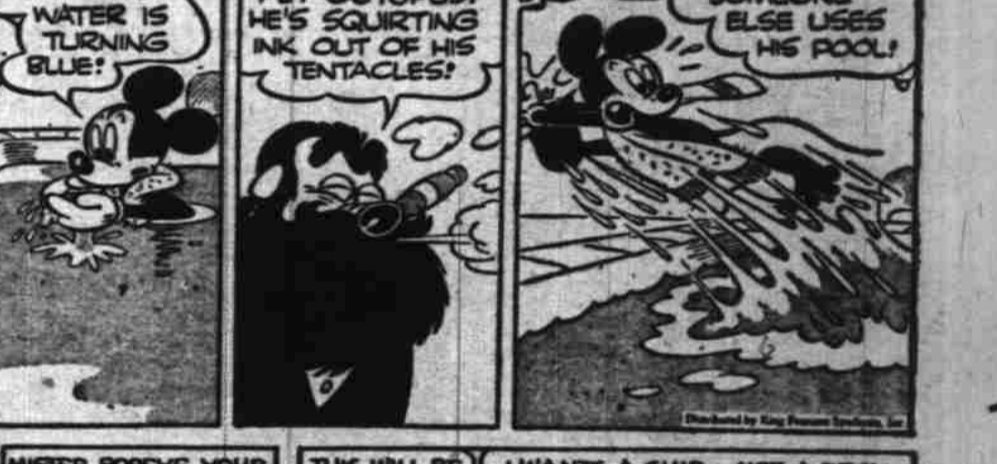
IT ALWAYS UPSETS CUDDLES WHEN SOMEONE ELSE USES HIS POOL!