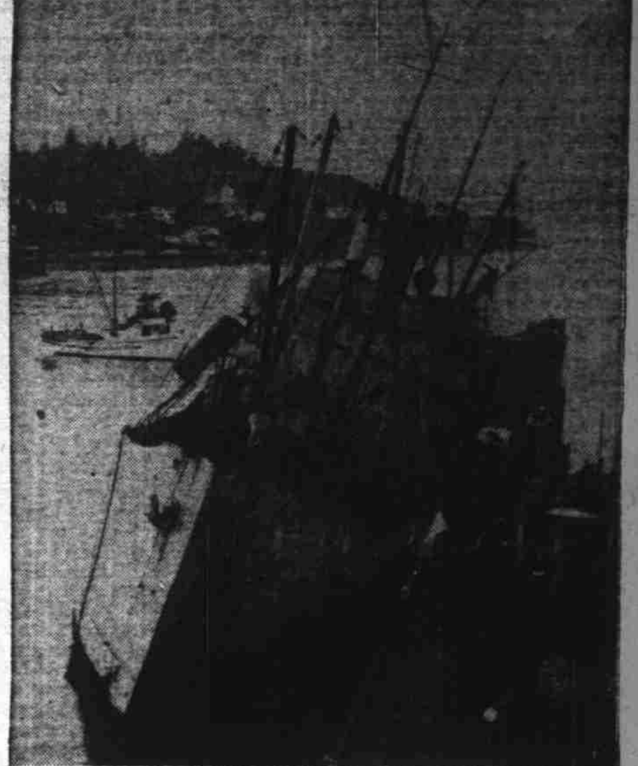
One man was drowned when an army tug sank after ramming an army transport service freighter near the outer entrance to the Lake Washington ship canal, Seattle. The larger vessel was severely damaged in the collision, developing an immediate list and settling rapidly. The army transport freighter, listing badly, is shown made fast to a dock in the canal. A collision mast covers the hole in her hull just above the waterline.