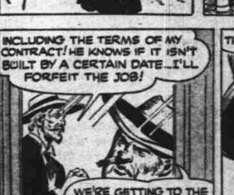
THE LONE RANGER