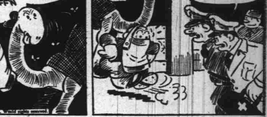
PER GOSH SAKE, MICKY... I THINK YOU'RE A BIG SISSY!