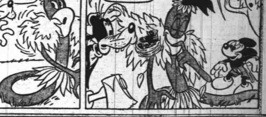
AND THE CANNIBAL PLANT HAS BEEN KNOWN TO SWALLOW AND DIGEST HUMAN BEINGS!