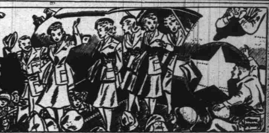
YOU BETTER GET A HORSE DOCTOR TO LOOK AFTER HIM, CAPTAIN!