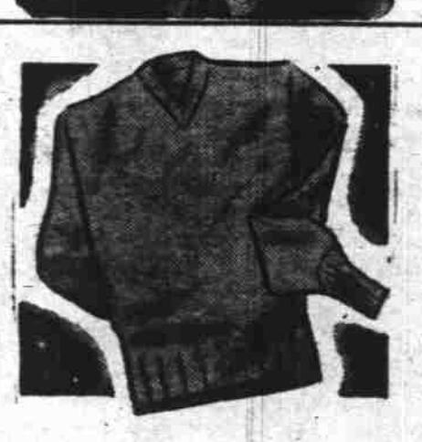
SWEATERS All wools, camels hair and mixtures. Choose his in a slipon or coat style. Sizes 36 to 46.