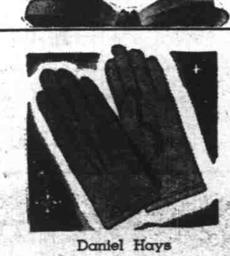
GLOVES The best name in men's gloves.

Pigskins, capes, goats and mochas. Also wool lined capes. $2.50 to $5.00