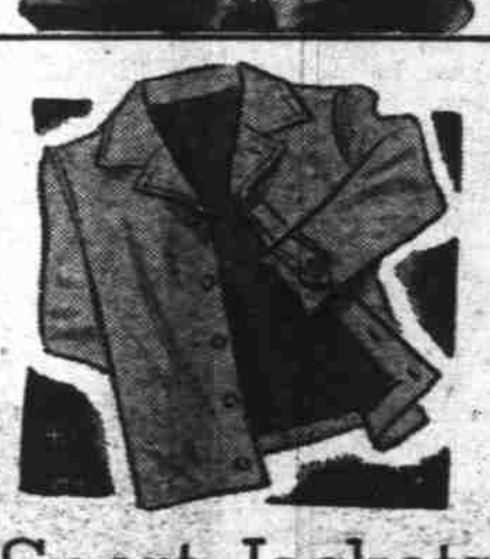
Sport Jackets From light-weight water repel-lants to hand-tailored Hobby coats by Kuppenheimer and handsome suedes by Scully.

Pigskins, capes, goats and mochas. Also wool lined capes. $2.50 to $5.00