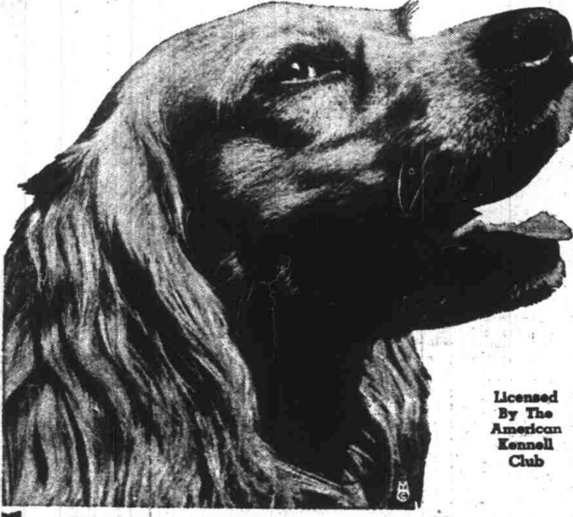
Licensed By The American Kennel Club

The catch of bottom fish, 75 per cent of which is going to the army, also was reported improving here and at Astoria.