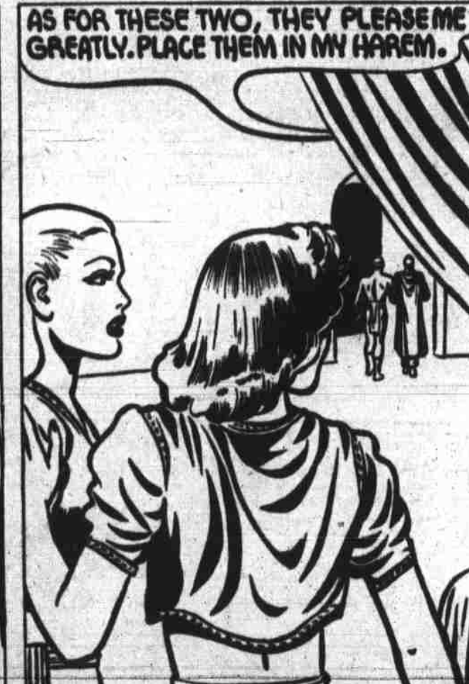
7 AS FOR THESE TWO, THEY PLEASE ME GREATLY. PLACE THEM IN MY HAREM. CONT'D.