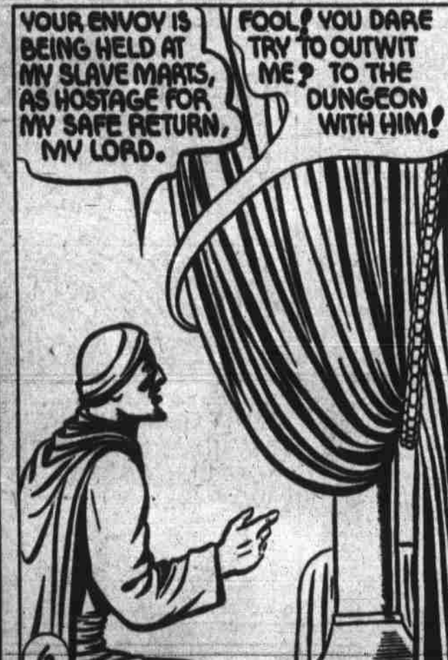
6 YOUR ENVOY IS BEING HELD AT MY SLAVE MARKS, AS HOSTAGE FOR MY SAFE RETURN, MY LORD. FOOL! YOU DARE TRY TO OUTWIT ME? TO THE DUNGEON WITH HIM!