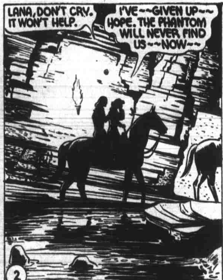
2 LANA, DON'T CRY. IT WON'T HELP. I'VE--GIVEN UP--HOPE. THE PHANTOM WILL NEVER FIND US--NOW-- STILL NO SIGN OF THE HIDDEN CITY--THEY ENTER A TUNNEL THRU A HIGH HILL