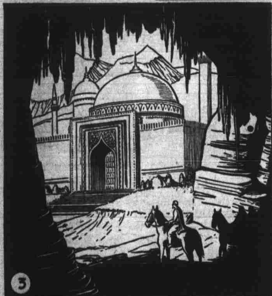
3 THEY EMERGE FROM THE TUNNEL TO SEE THE FORBIDDEN HIDDEN CITY--A GLEAMING CITY OF GOLD AND RUBIES AND SAPPHIRES!