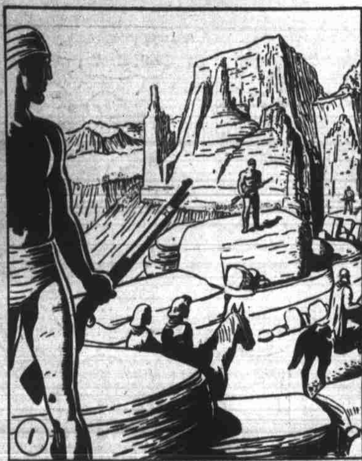
1 SIDUUN, THE SLAVER, BRINGS GRETA AND LANA INTO THE HIDDEN KINGDOM OF HAMID, THE TERRIBLE--THEY RIDE BETWEEN ROWS OF GIANT GUARDS