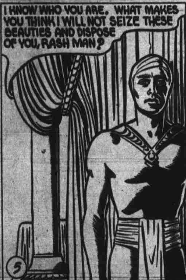
5 THE VOICE OF HAMID COMES FROM BEHIND THE CURTAIN, DEEP AND MENACING.